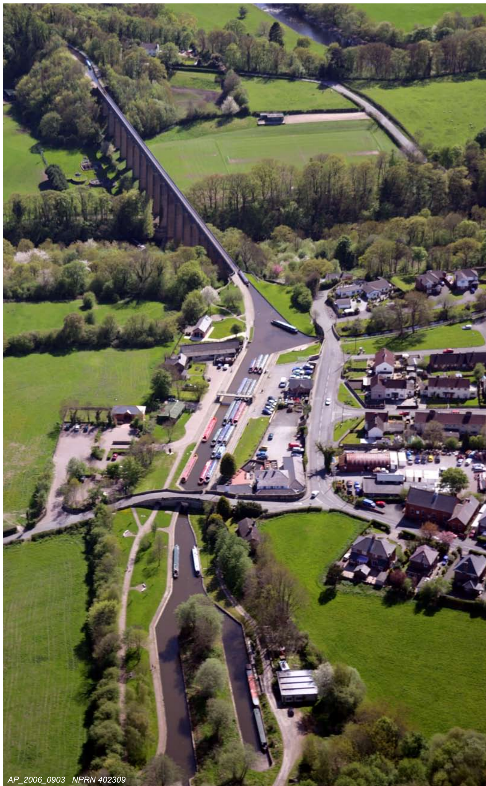
AP_2006_0903 NPRN 402309

Left: Nineteenth-century watercolour showing the Tŷ Craig limekilns on the Llangollen Canal. This was the head of navigation for the waterway in 1808.