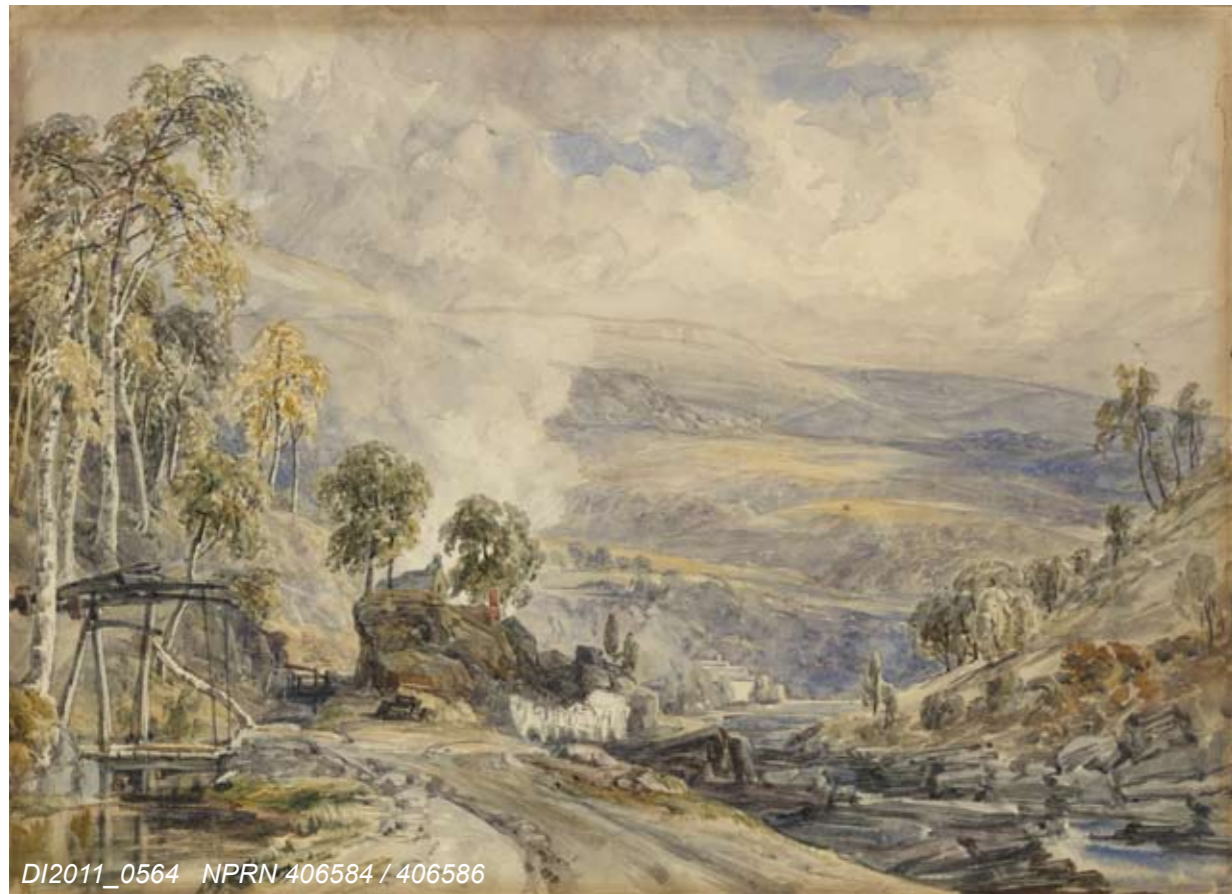
DI2011_0564 NPRN 406584 / 406586

Dynodwyd Dyfrbont a Chamlas Pontcysyllte yn Safle Treftadaeth Byd yn 2009 ar ôl gwaith cofnodi ac ymchwilio helaeth gan y Comisiwn Brenhinol. Mae'r ddyfrffordd arloesol yn symbol o'r newid o lwybrau cludo a lynai'n glôs wrth y dirwedd i'r rhai a frasgamai drosti. Bu'n fodd i hwyluso cludo defnyddiau crai a nwyddau yn y bedwaredd ganrif ar bymtheg.