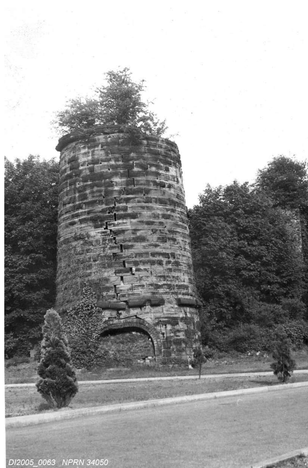
DI2005_0063 NPRN 34050

Left: Pontcysyllte Aqueduct and Canal still has a thriving tourist industry. This nineteenth-century postcard shows a horse drawn boat at Chirk tunnel. From the National Monuments Record of Wales: D. L. Davies Collection.