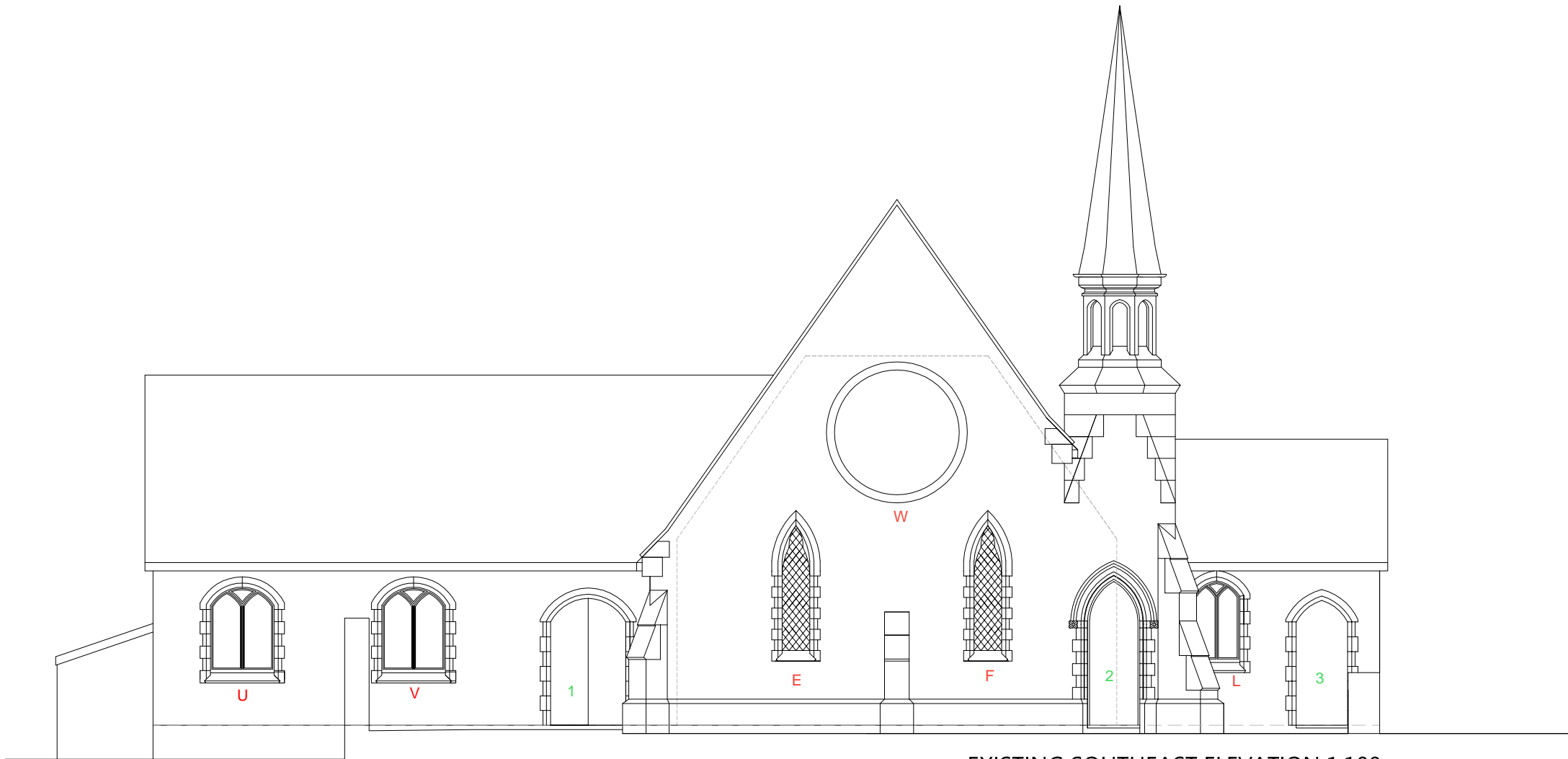
EXISTING SOUTHEAST ELEVATION 1:100