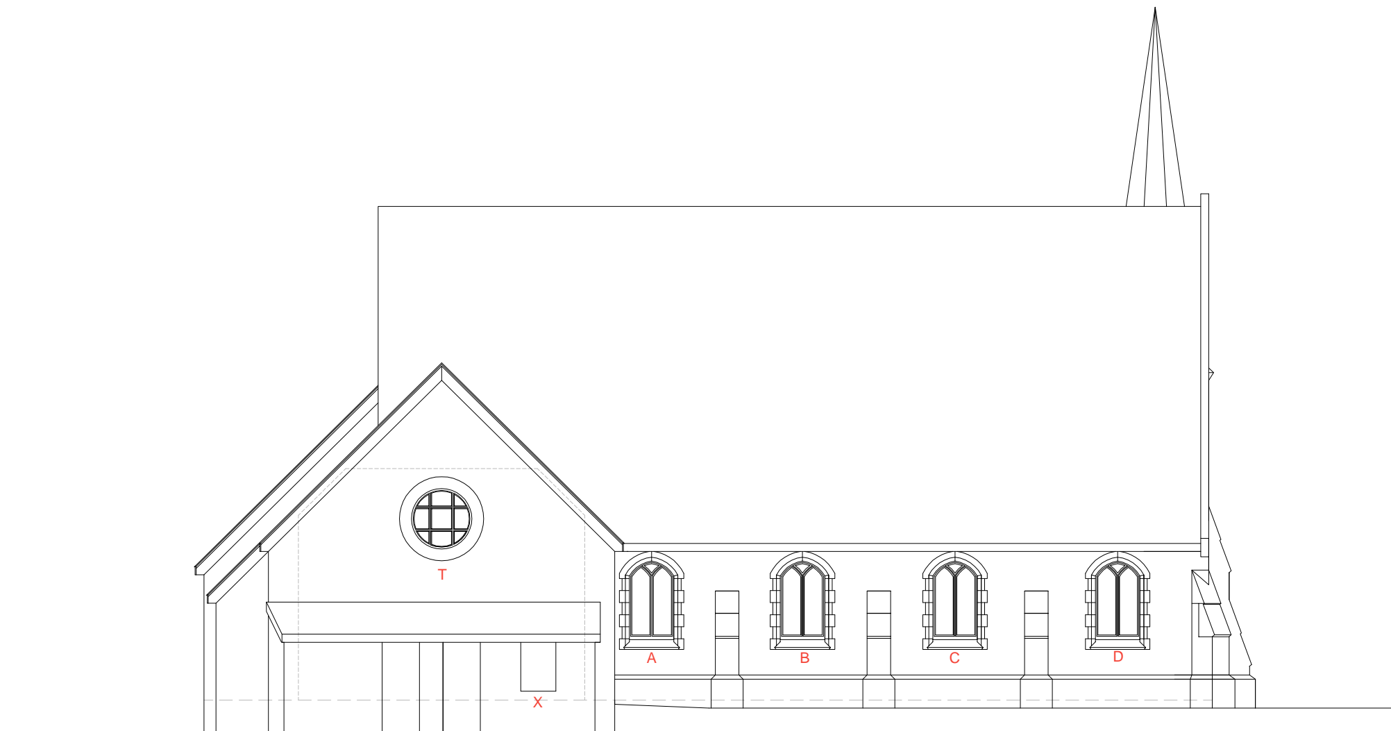
EXISTING SOUTHWEST ELEVATION 1:100

DO NOT SCALE FROM THIS DRAWING. ALL DIMENSIONS TO BE CHECKED ON SITE. ASSUMPTIONS SHOULD NOT BE MADE.