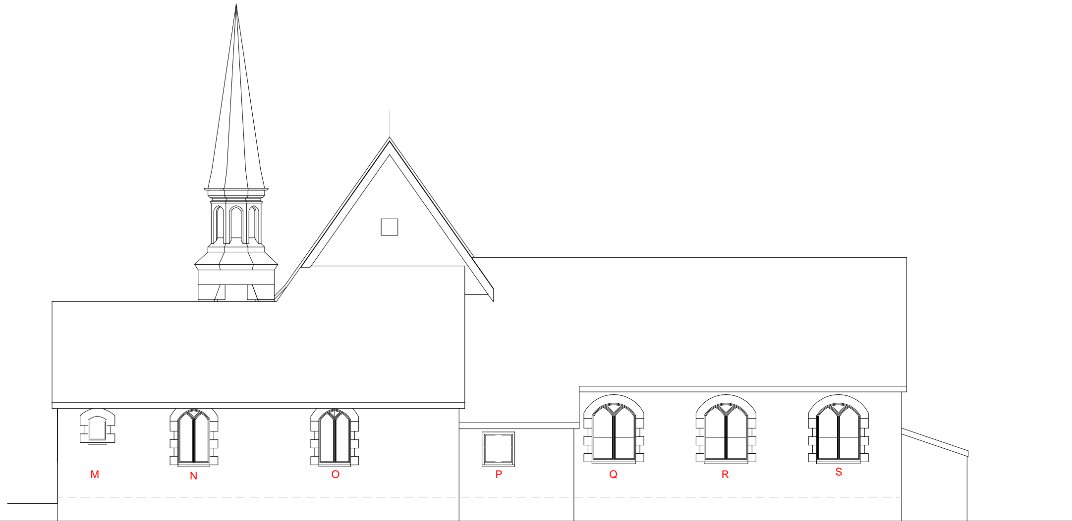
EXISTING NORTHWEST ELEVATION 1:100

BETHANY CHURCH COLLEGE GREEN TYWYN GWYNEDD WALES LL369BS