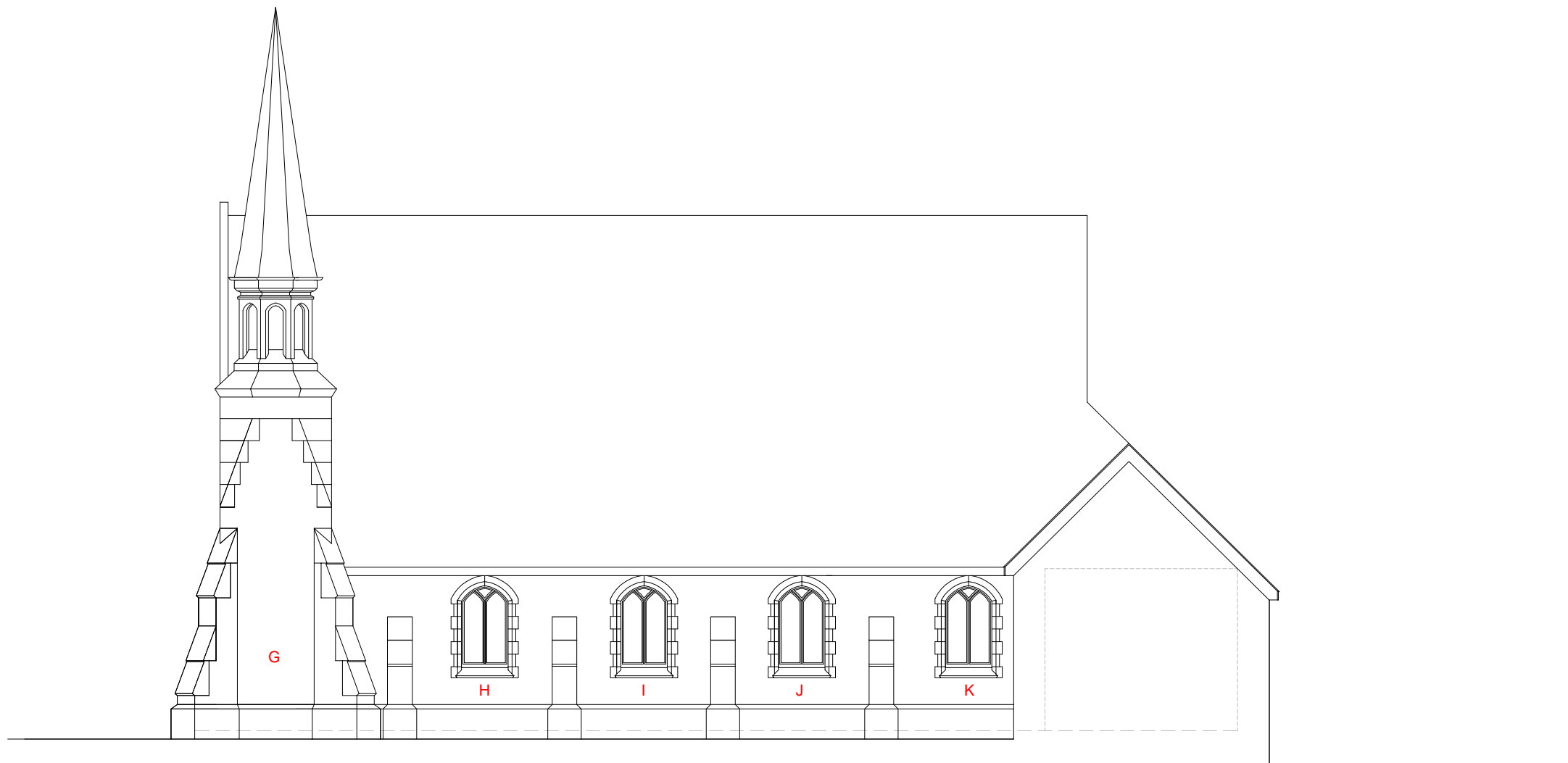
EXISTING NORTHEAST ELEVATION 1:100