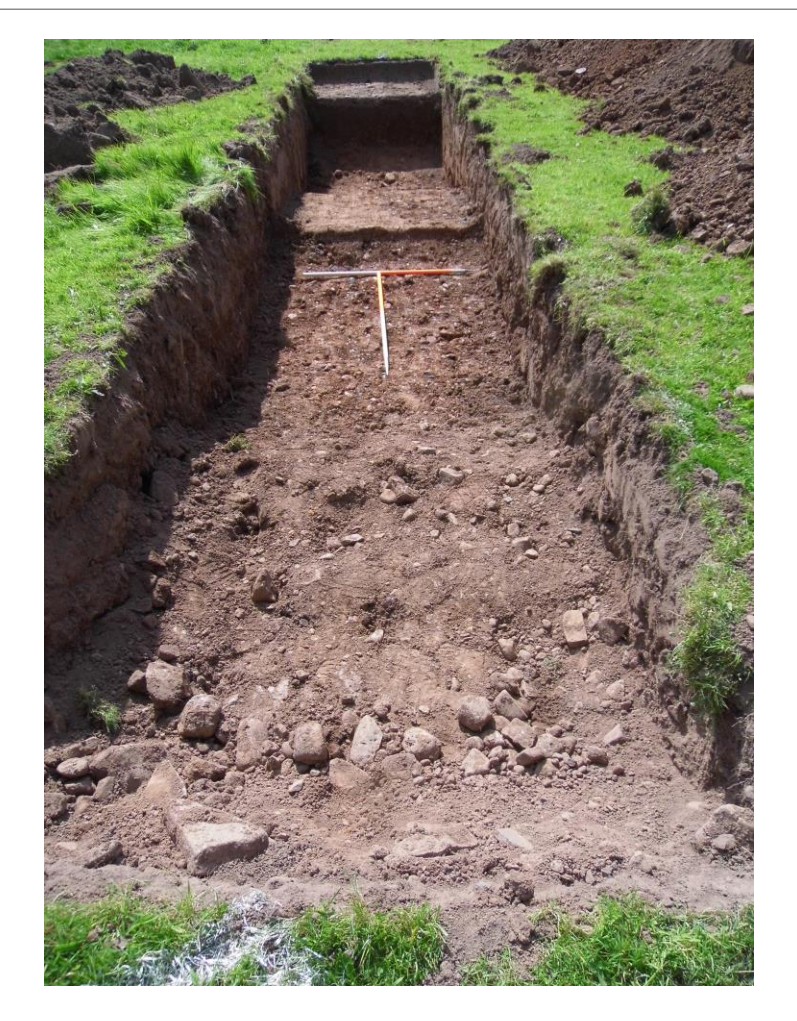
Plate 7: View E of Trench 7

Archaeological Field Evaluation July 2016