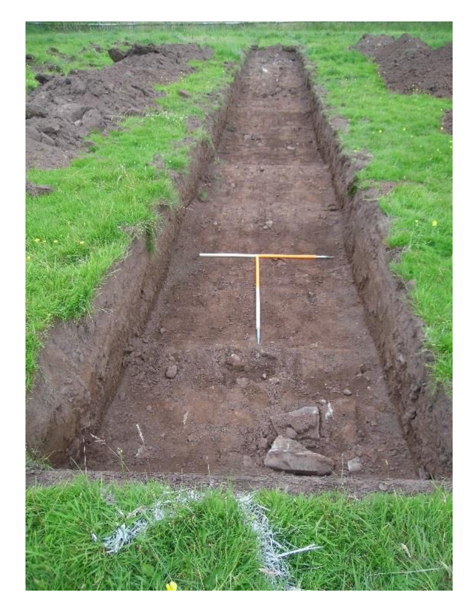
Plate 5: View S of Trench 5