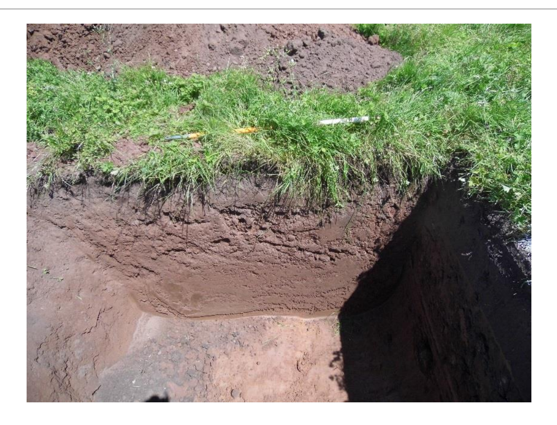
Plate 10: View N of sondage at SE end of Trench 10

Archaeological Field Evaluation July 2016