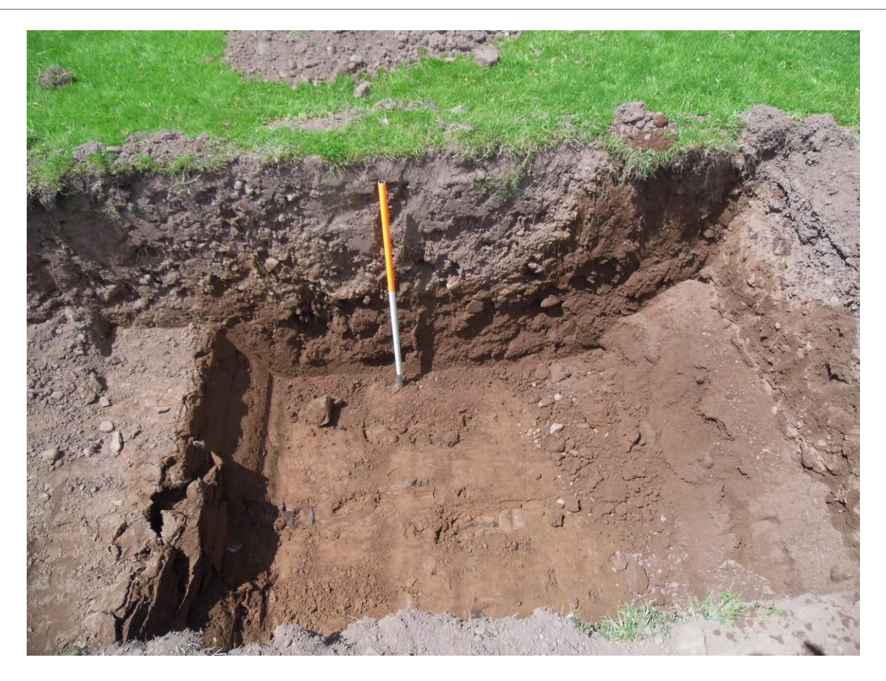
Plate 3: View SW of sondage into natural deposits in Trench 3

Archaeological Field Evaluation July 2016