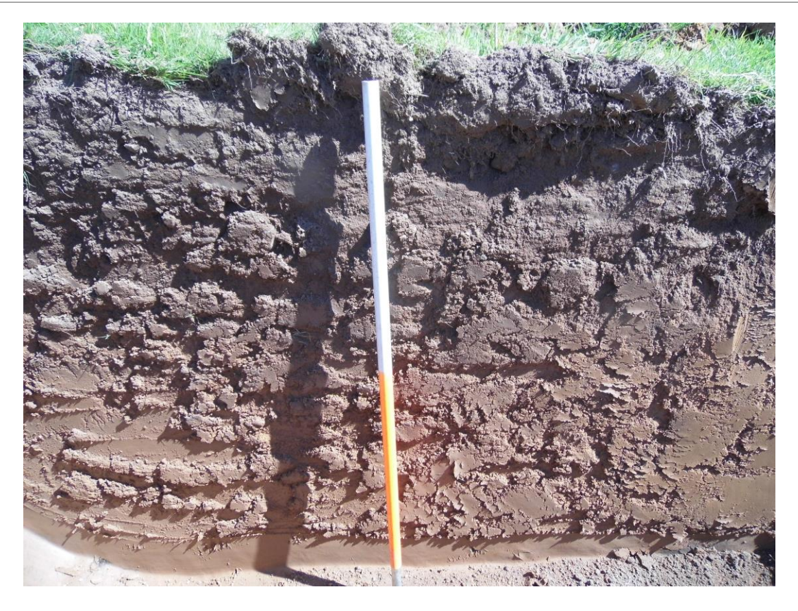
Plate 4: View NNE showing sample section in Trench 4