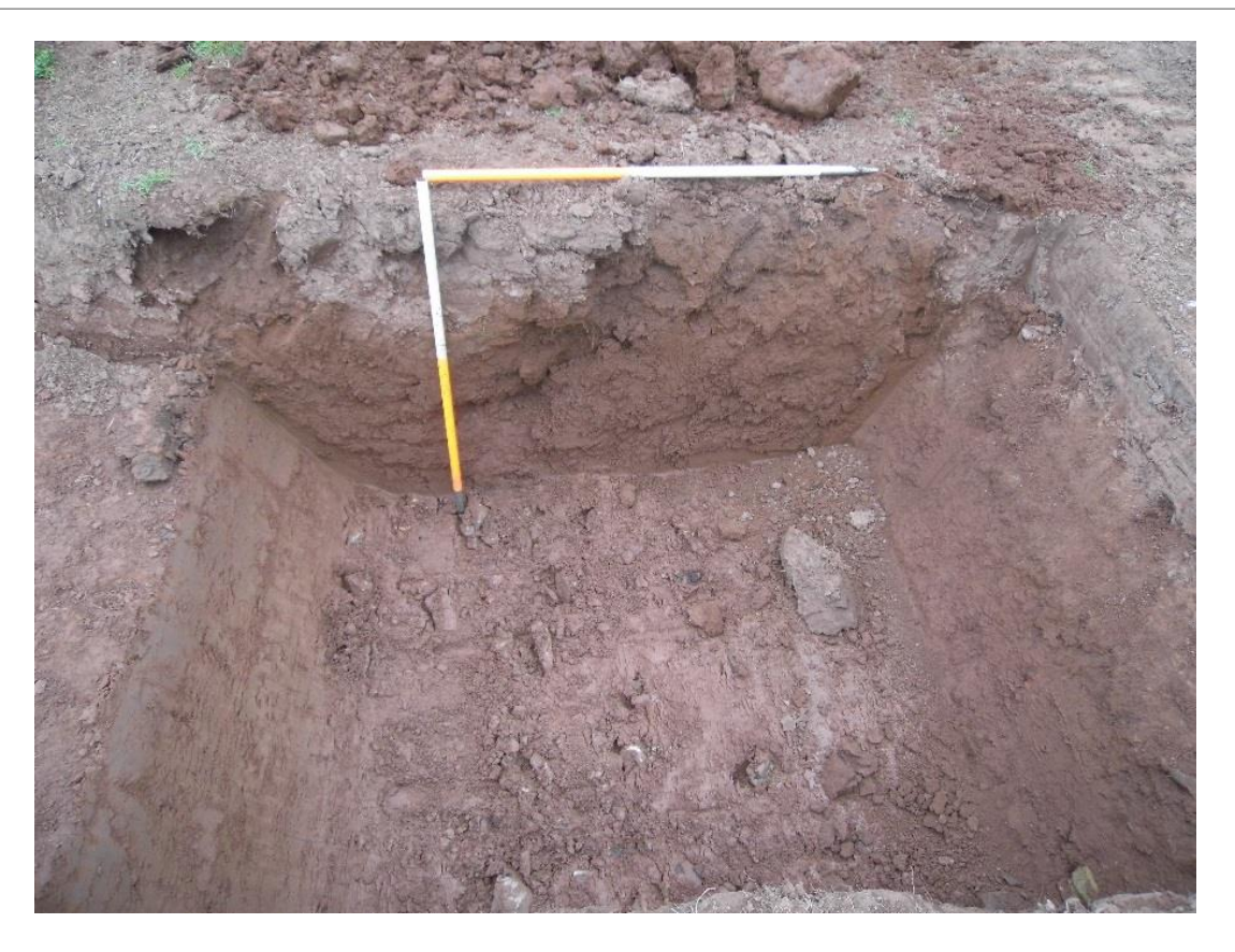
Plate 6: View NW of sondage in Trench 6

Archaeological Field Evaluation July 2016