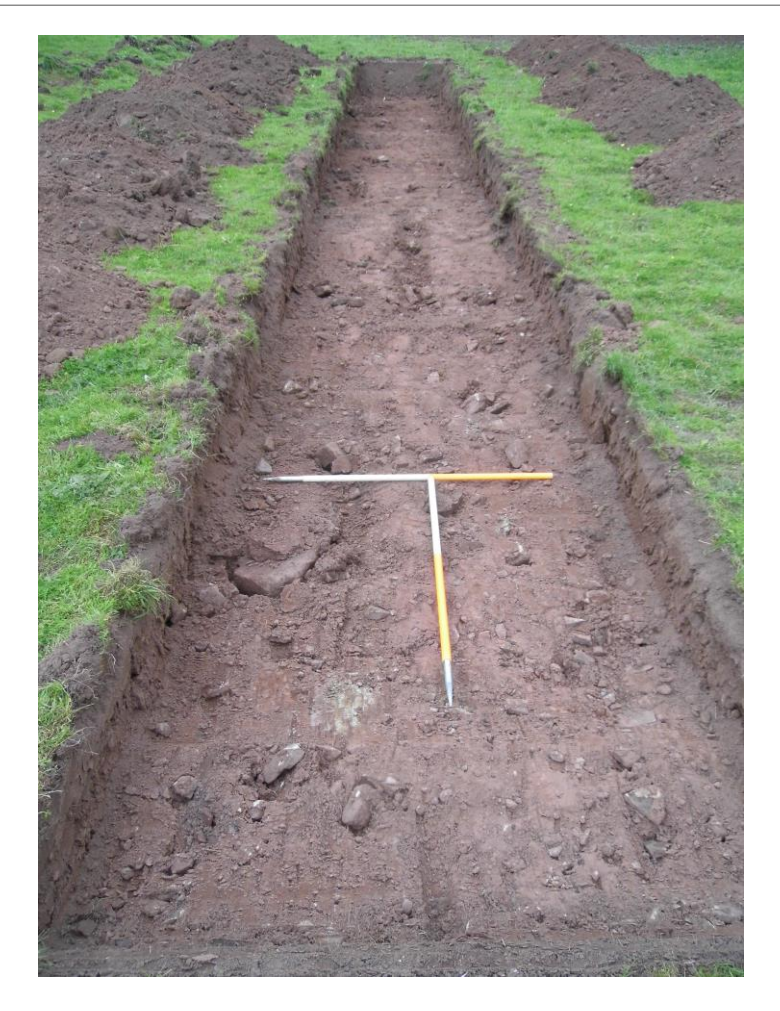
Plate 9: View NNE of Trench 9

Archaeological Field Evaluation July 2016