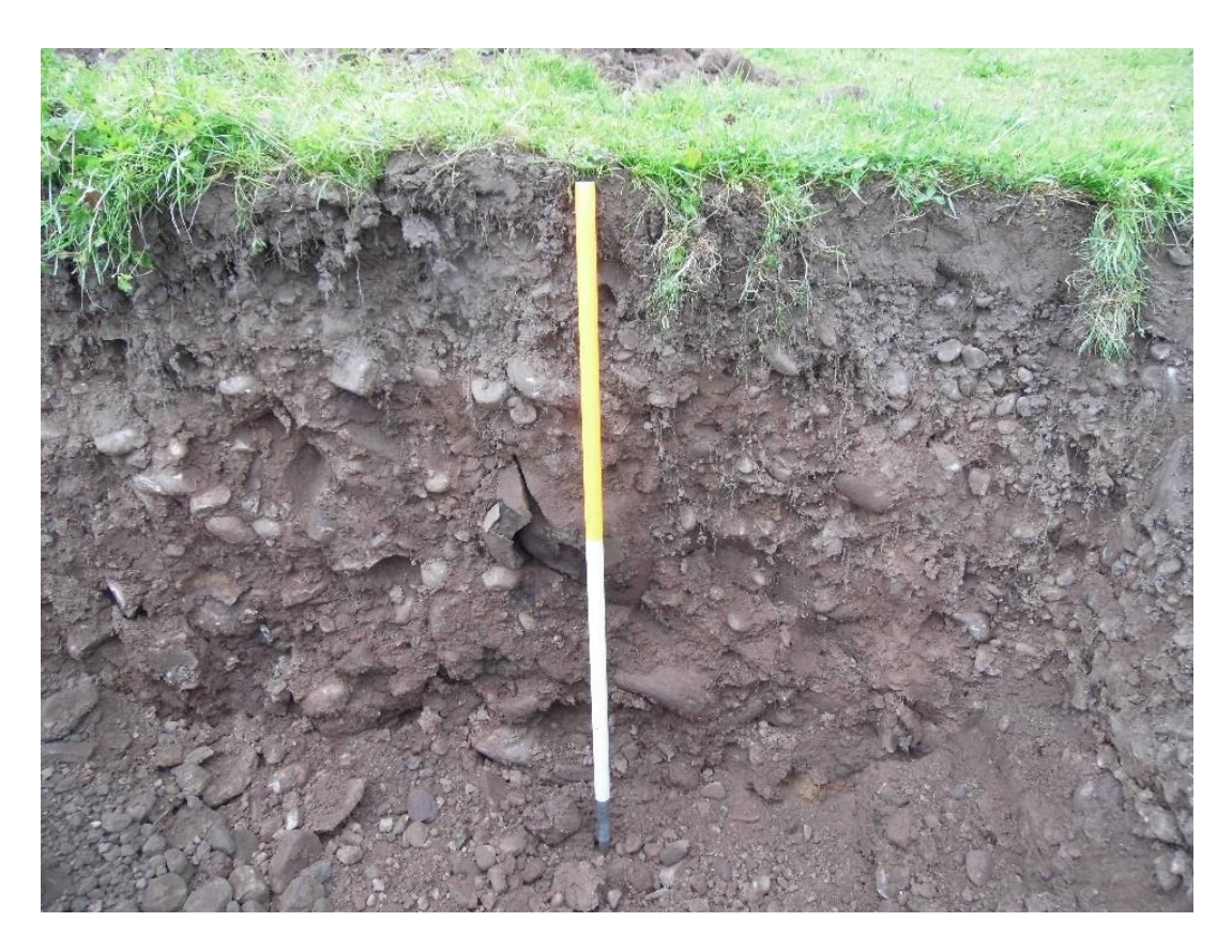
Plate 11: View NW showing natural stony deposit at NE end of Trench 11

Archaeological Field Evaluation July 2016