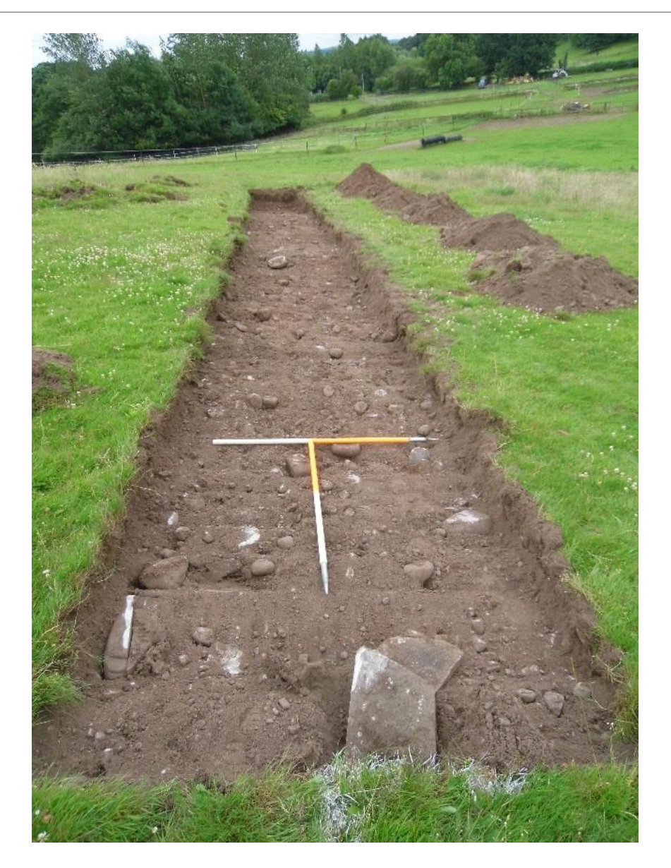
Plate 1: View SW of Trench 1

Archaeological Field Evaluation July 2016