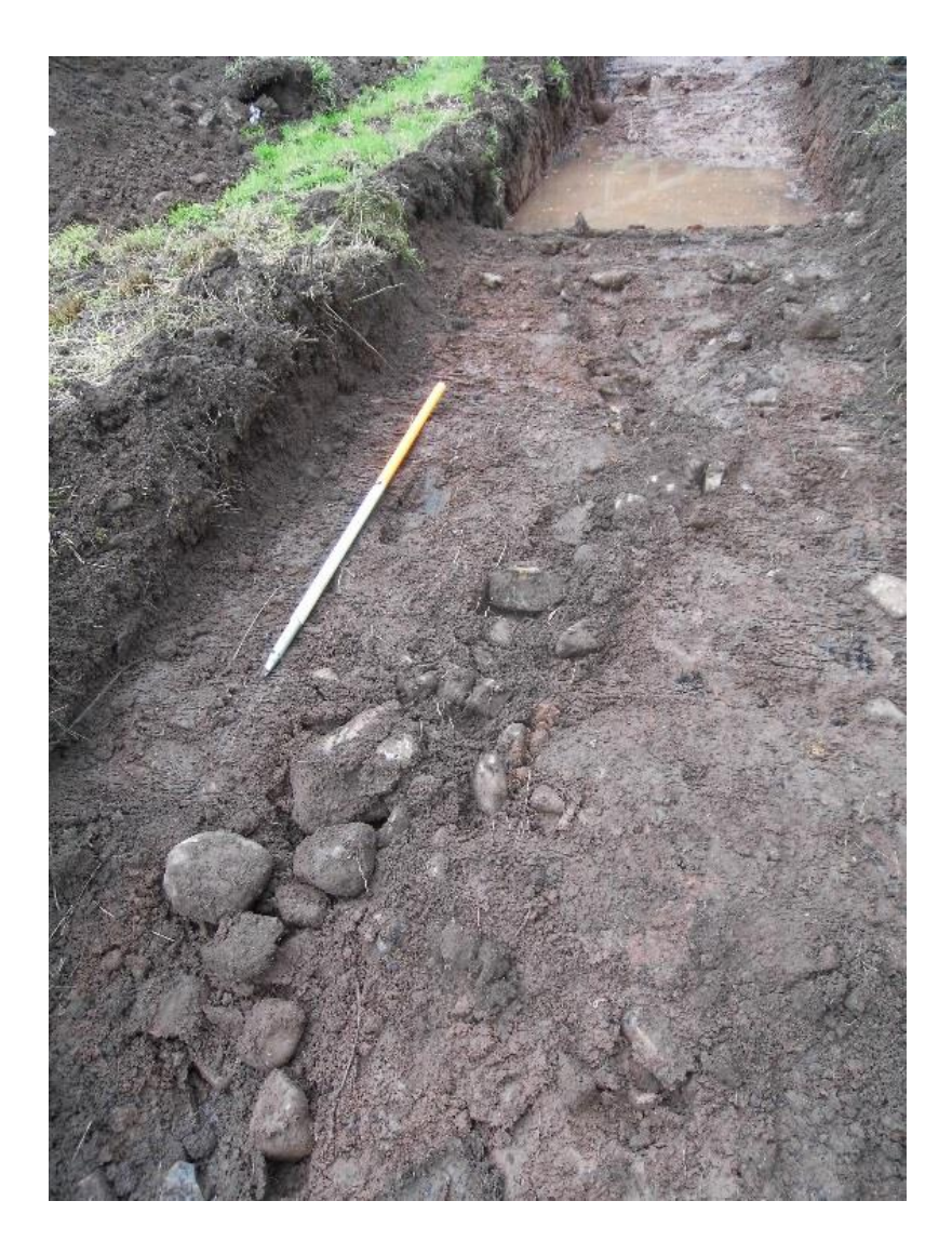
Plate 8: Detail of stone-filled land drains [806] and [808]