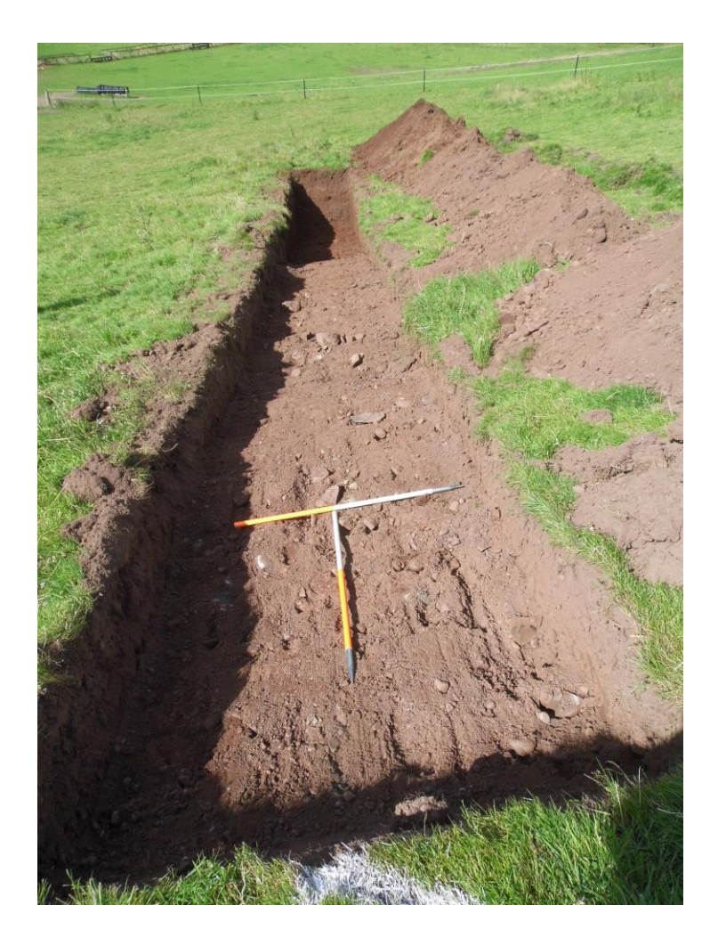
Plate 2: View SW of Trench 2