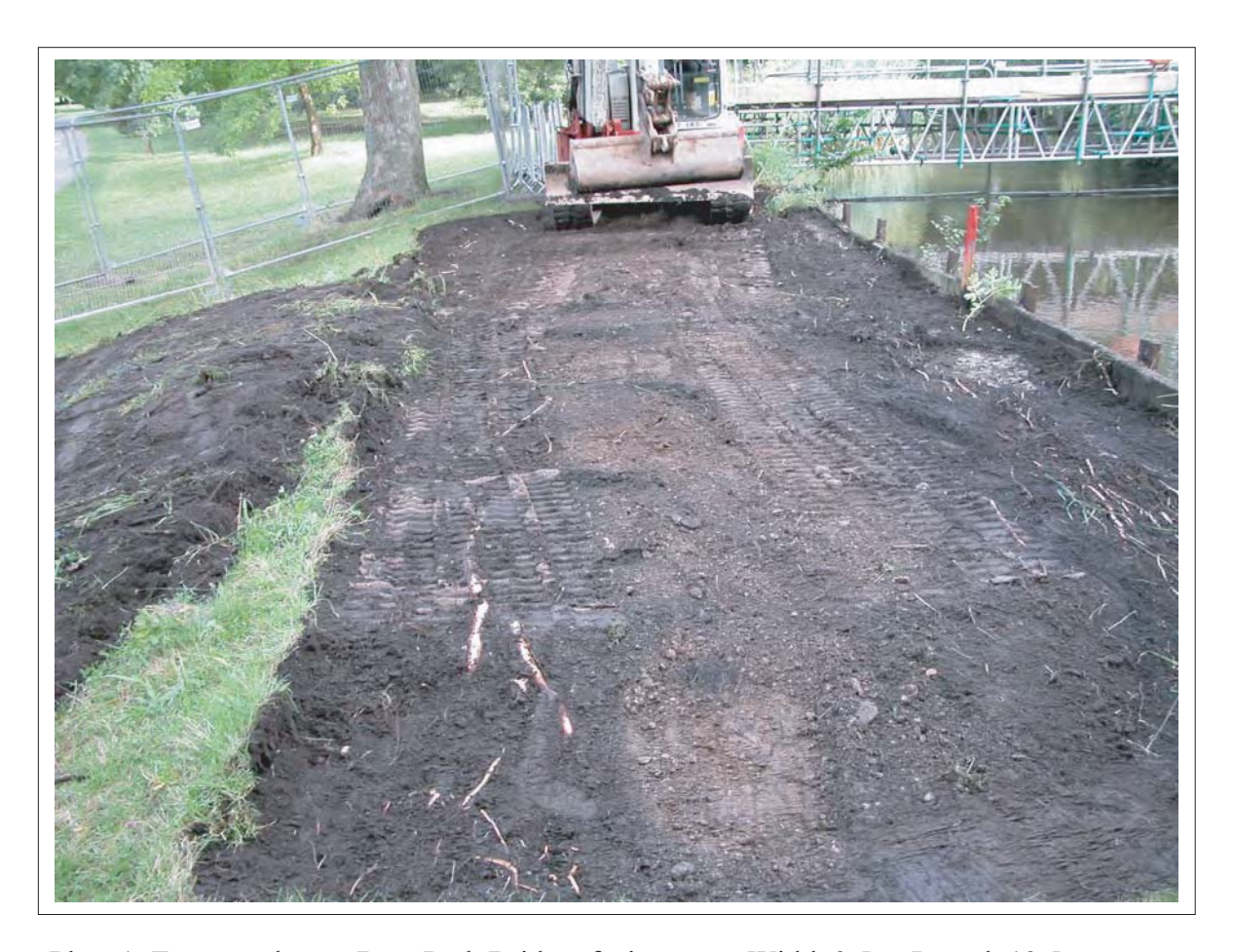
Plate 1: Excavated area, Bute Park Bridge, facing west. Width 3.5m, Length 13.5m