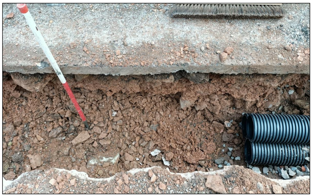
Plate 8. Representative section of excavations through pavement on north side of A466 (south-facing section)