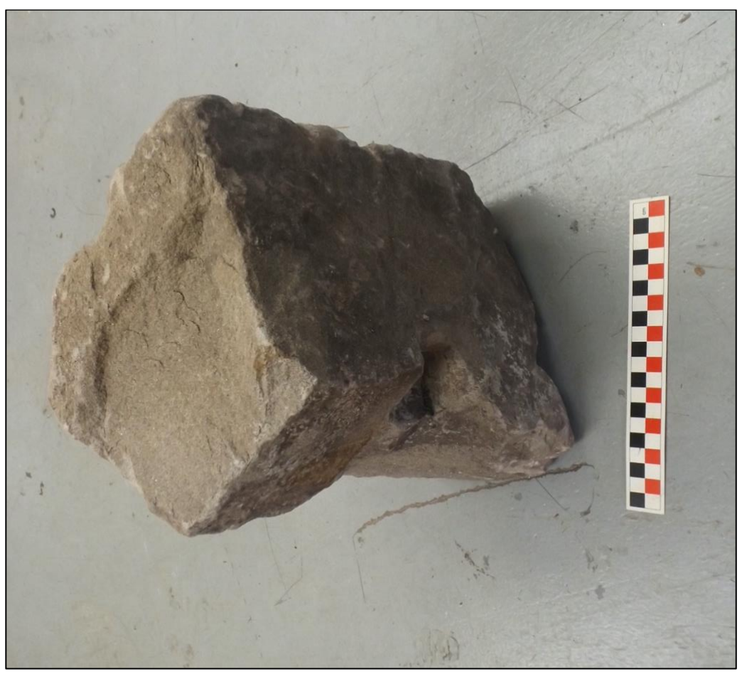
Plate 17. Medieval jamb stone from Tintern Abbey (SF2)