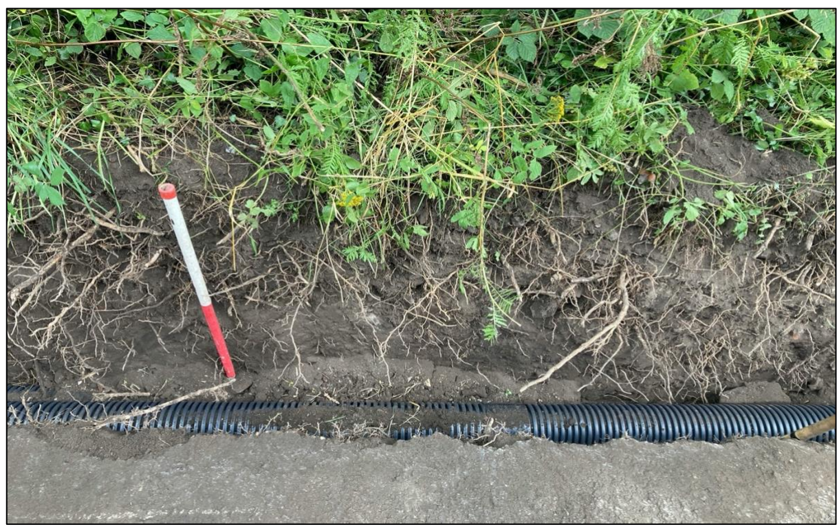
Plate 12. Representative section of excavations along roadway leading up Chapel Hill (south-facing section)