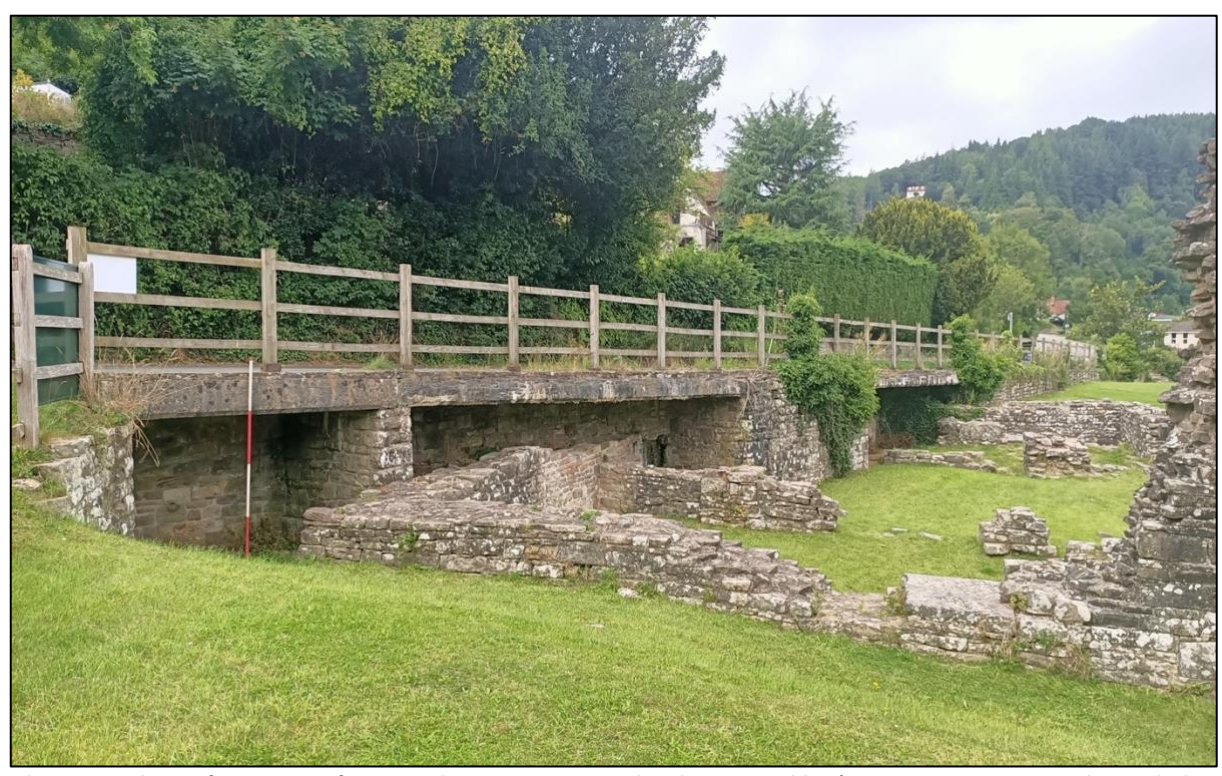
Plate 1. Southwest facing view of structural remains associated with Tintern Abbey's inner precinct running beneath the A466 roadway