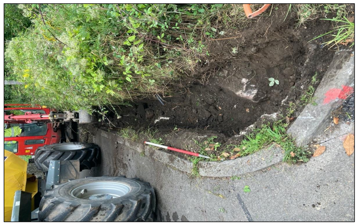
Plate 10. Excavations towards base of Chapel Hill (view southwest)