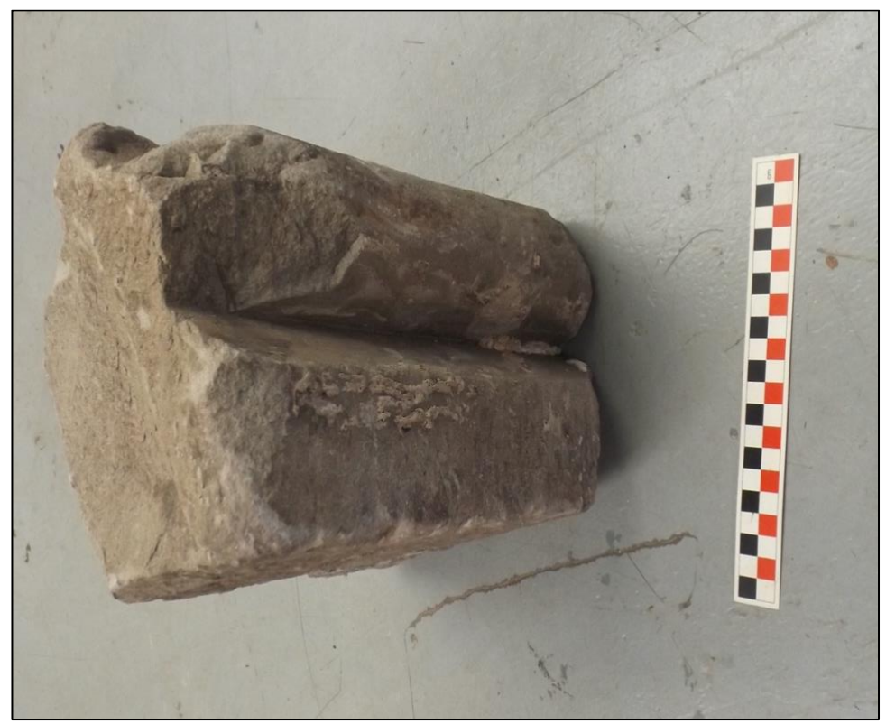
Plate 16. Medieval jamb stone from Tintern Abbey (SF2)