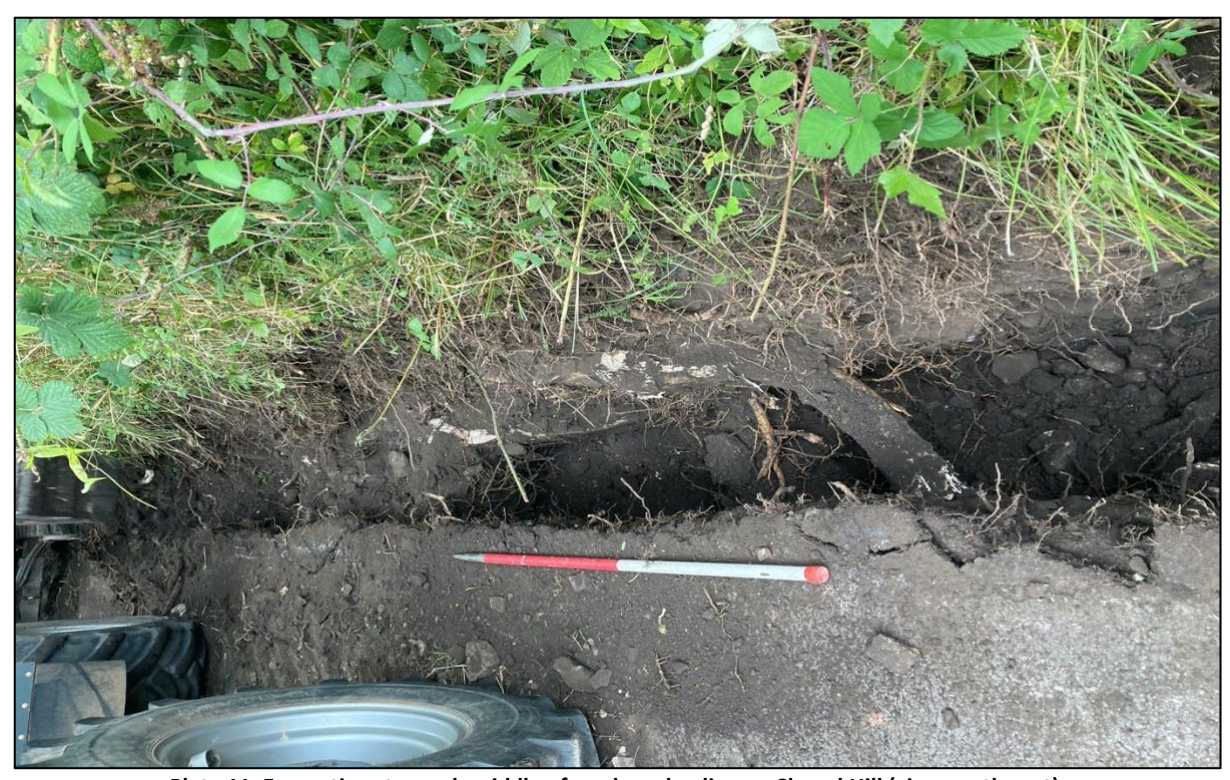
Plate 11. Excavations towards middle of roadway leading up Chapel Hill (view southwest)