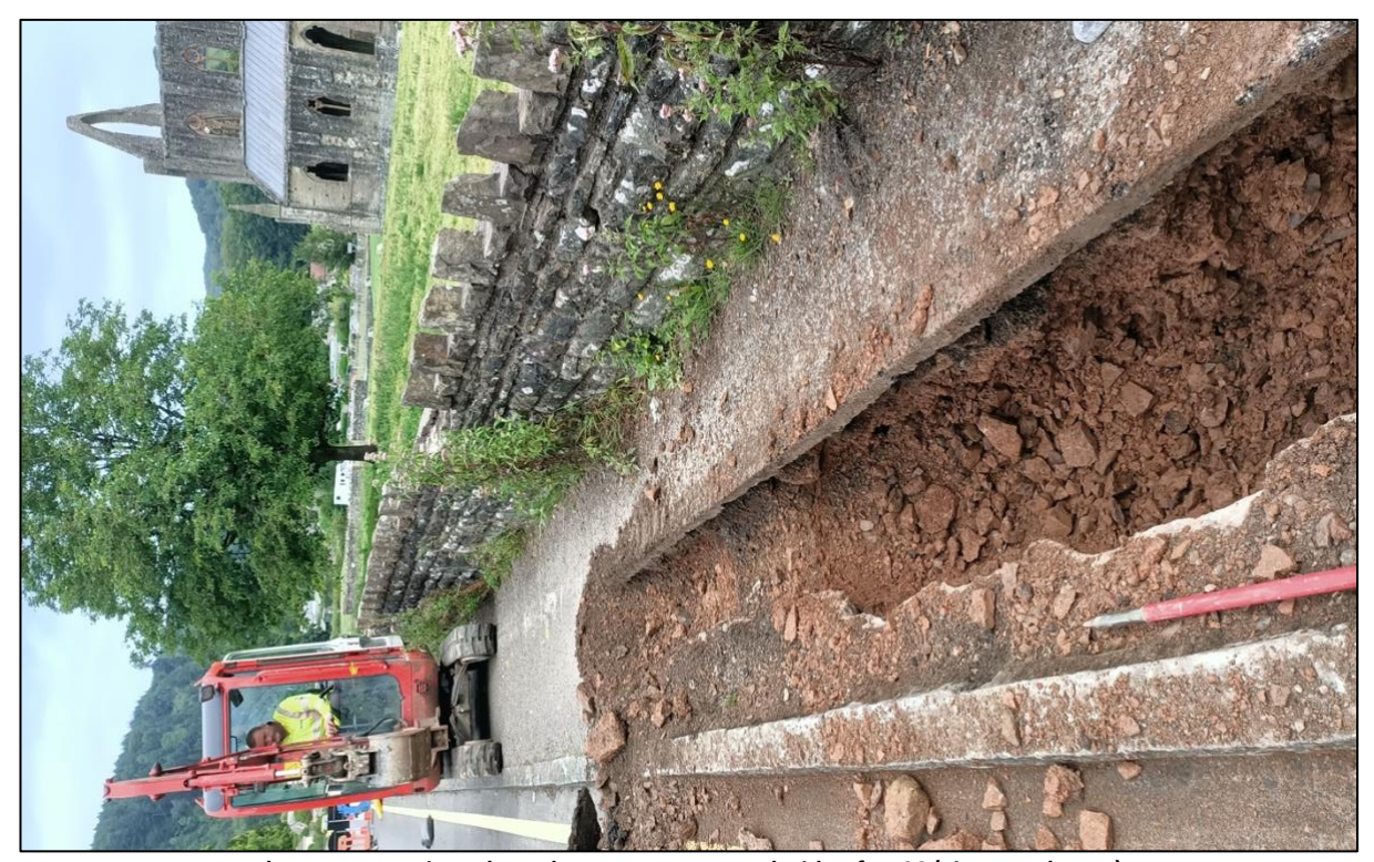
Plate 7. Excavations through pavement on north side of A466 (view northwest)