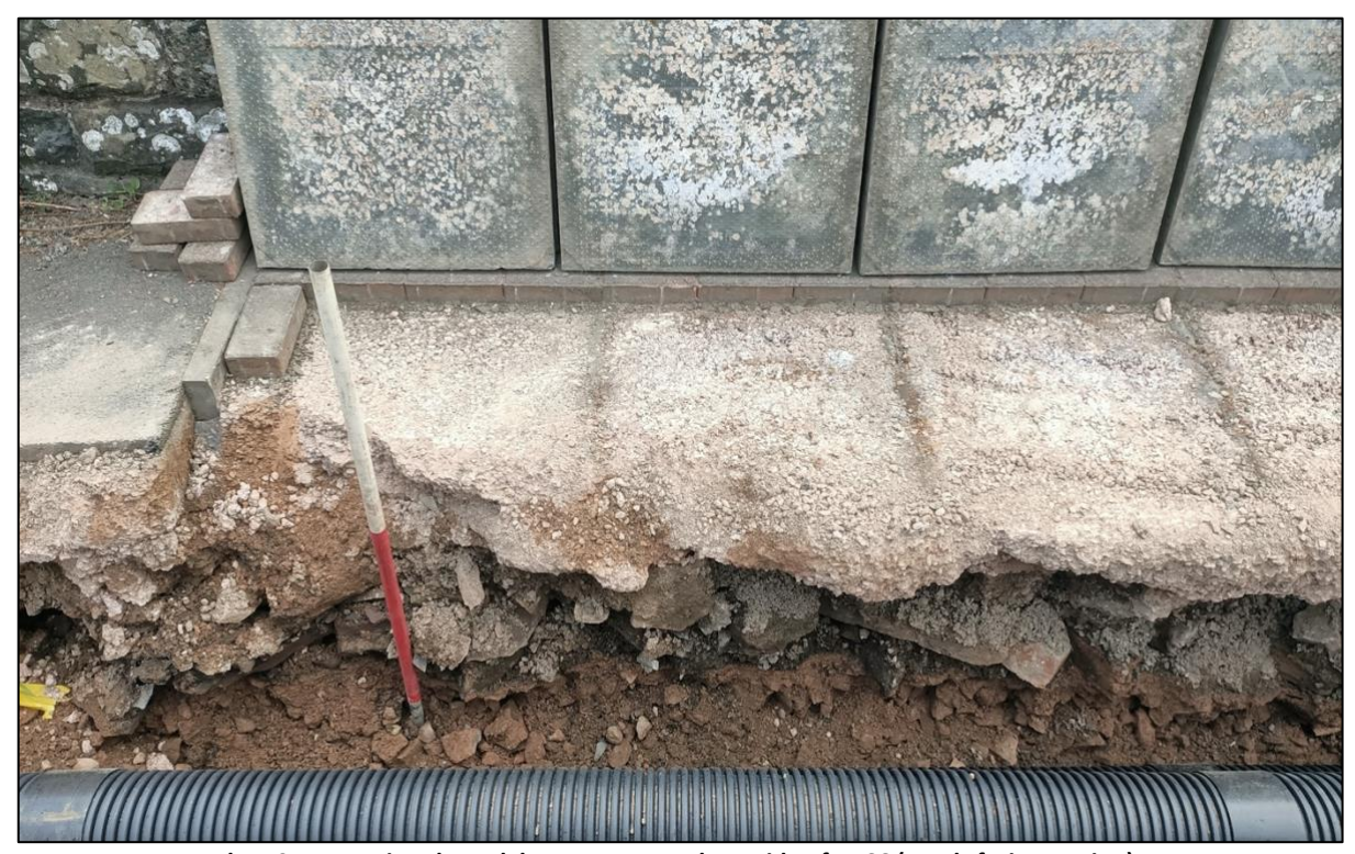
Plate 9. Excavation through bus stop on northern side of A466 (south-facing section).