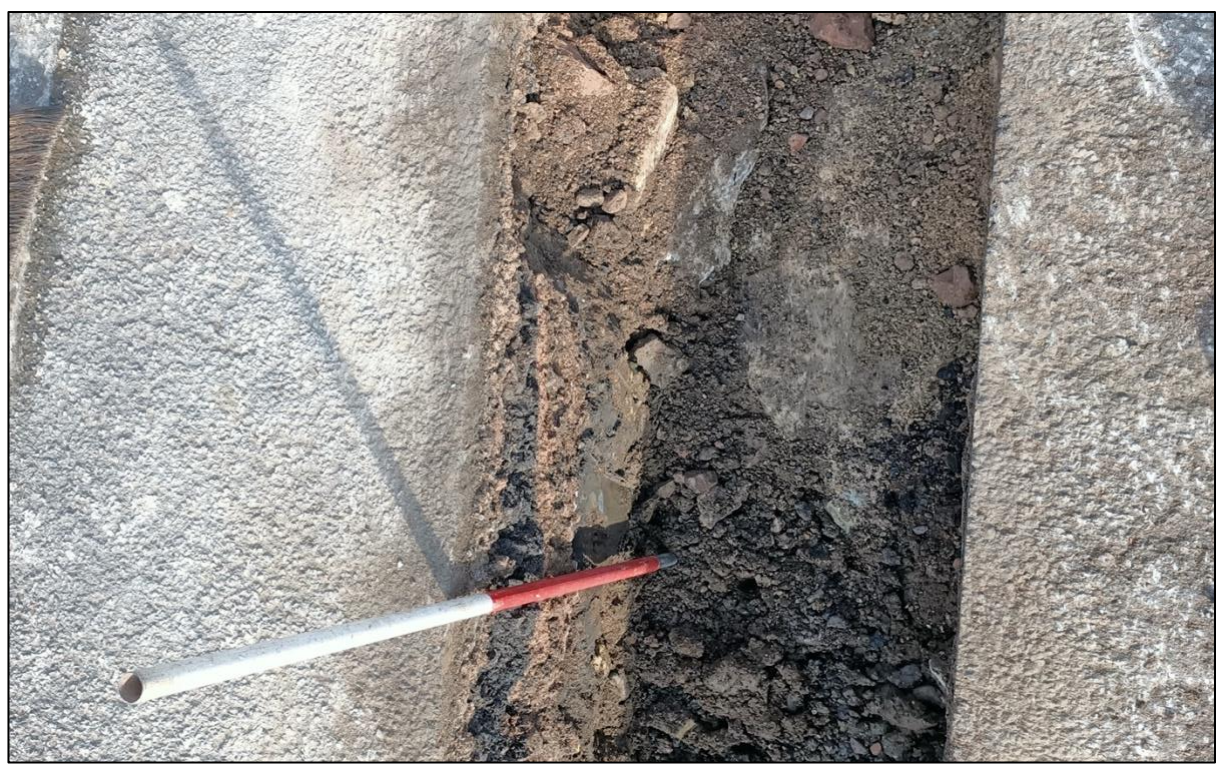
Plate 6. Discrete spread of mortar associated with possible wall [021] (north-facing section)