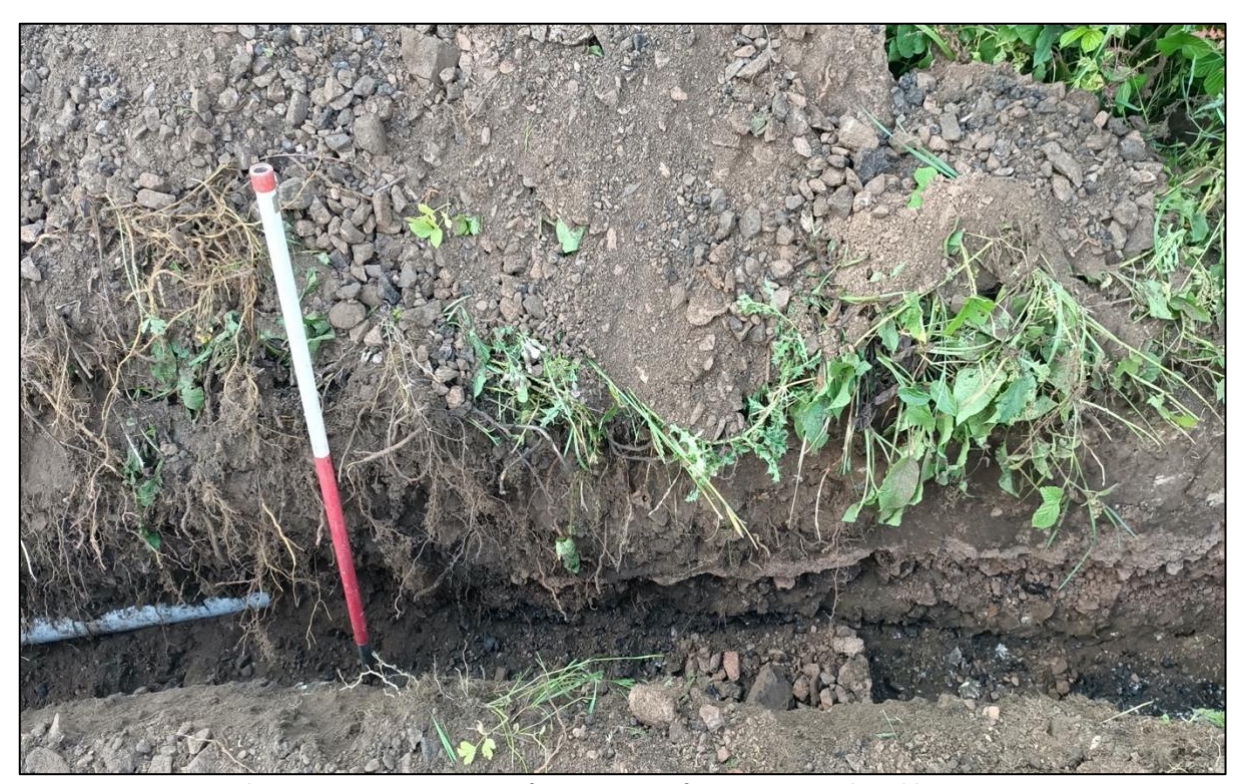
Plate 2. Representative west-facing section of excavations within Abbey Farm