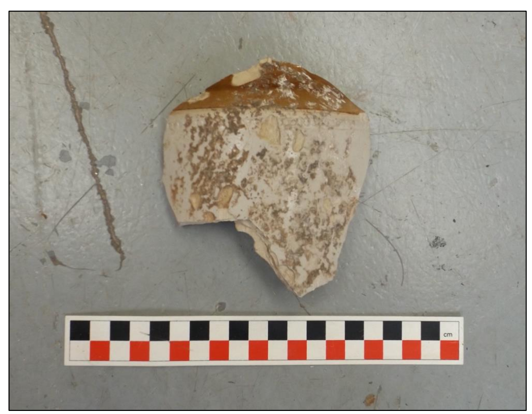
Plate 19. Sherd of Bristol glazed stoneware jar (SF3)