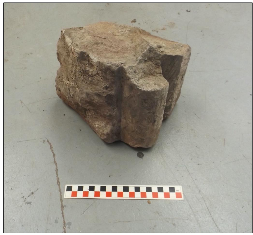
Plate 14. Medieval jamb stone from Tintern Abbey (SF1)