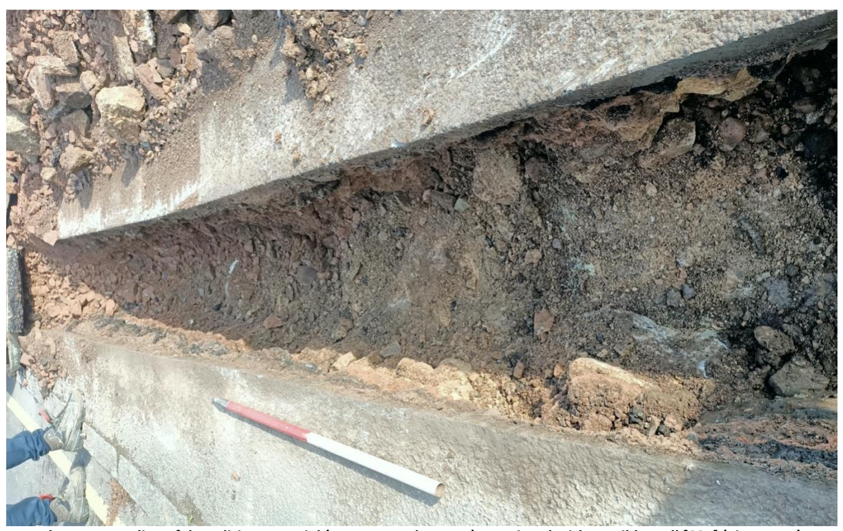
Plate 5. Revealing of demolition material (masonry and mortar) associated with possible wall [021] (view west)