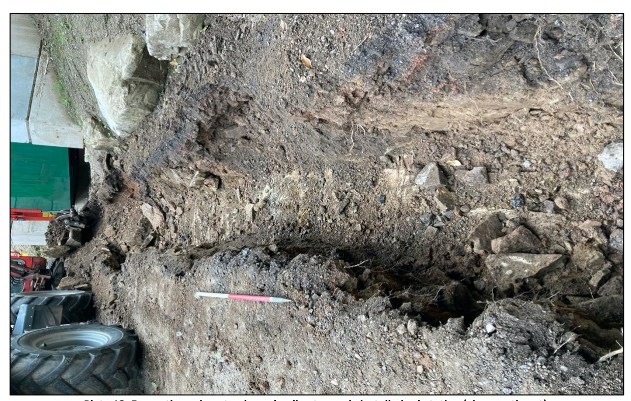
Plate 13. Excavations along trackway leading to newly installed substation (view southeast)