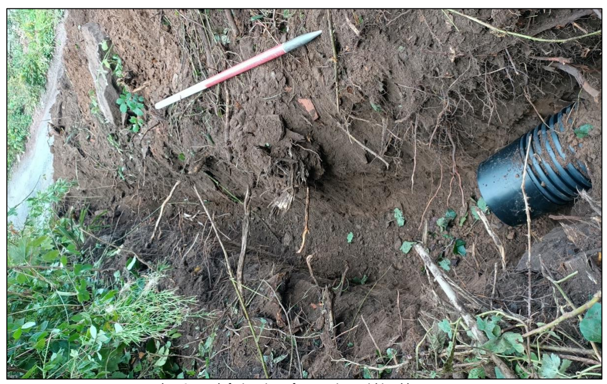
Plate 3. North-facing view of excavations within Abbey Farm