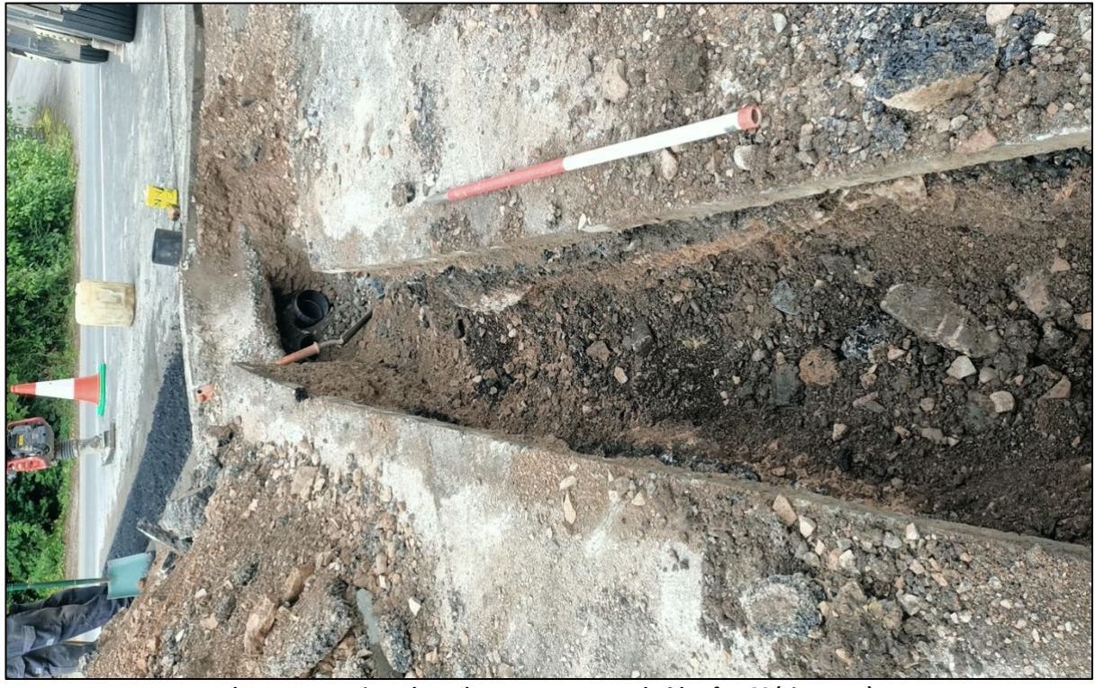
Plate 4. Excavations through pavement on north side of A466 (view east)