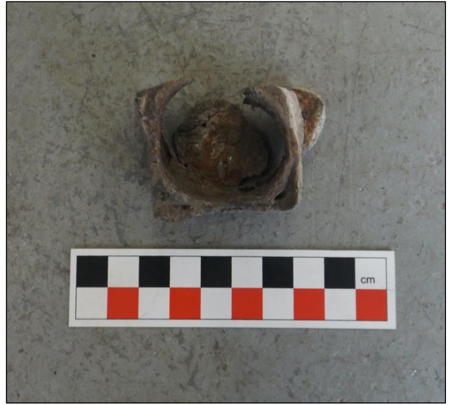
Plate 18. Solidified lead discovered within notch of SF2