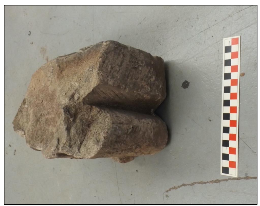
Plate 15. Medieval jamb stone from Tintern Abbey (SF1)