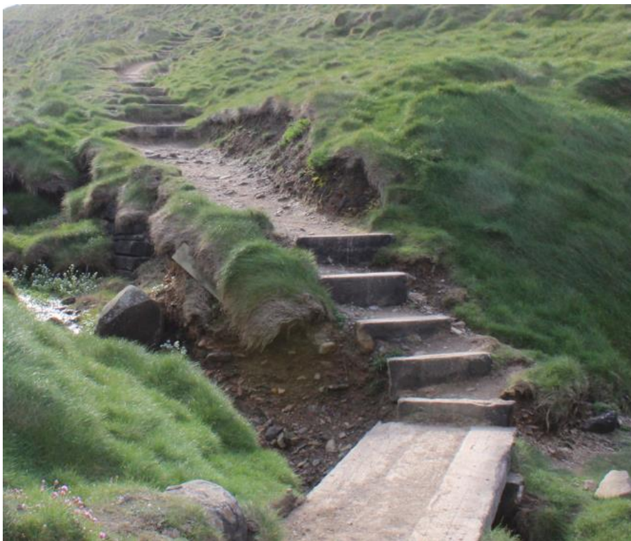
Figure 2. Photo showing location of steps/foot bridge to be removed, pinch point erosion also visible.