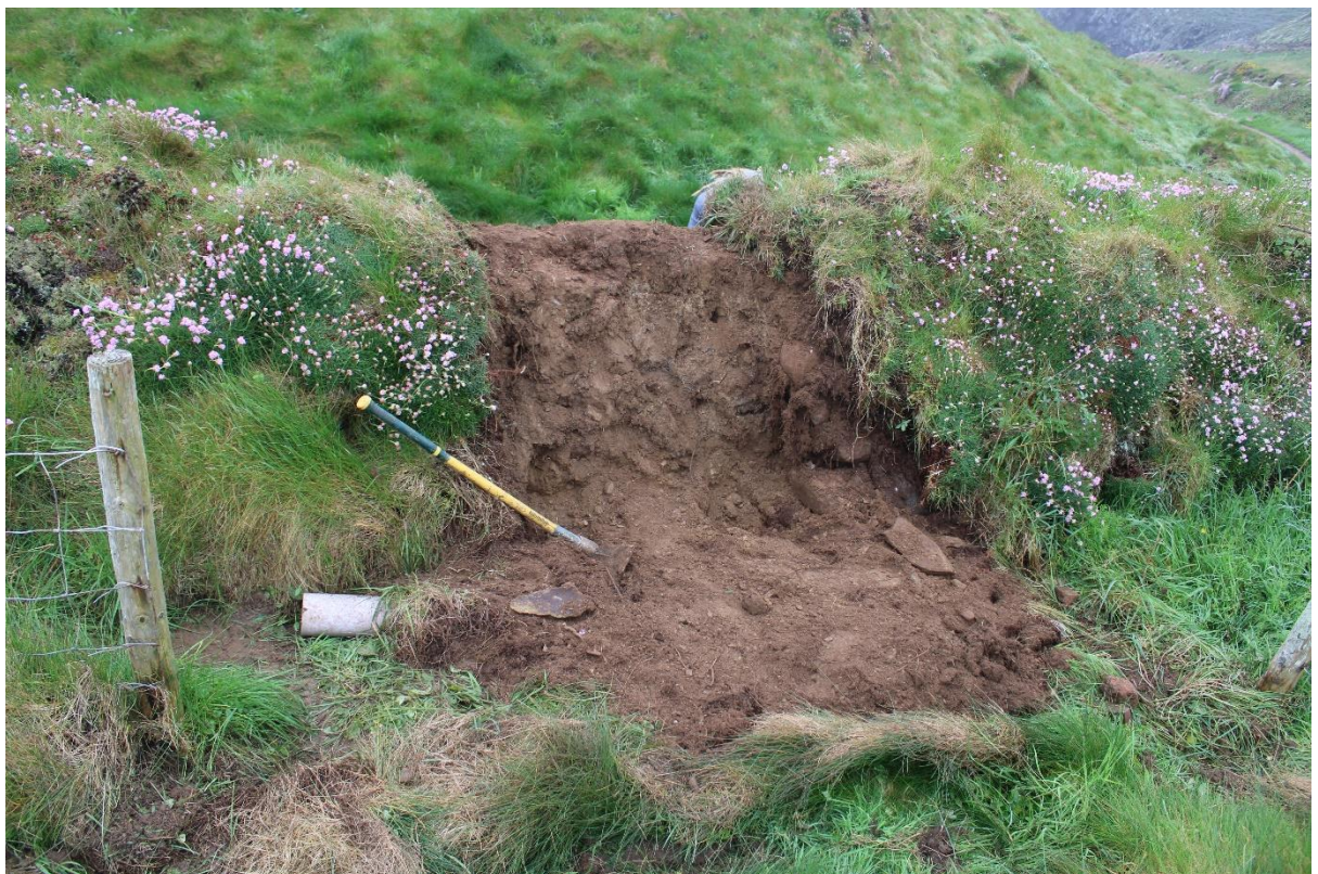
Figure 24. Photo showing the outer earth and stone layer of the bank on the side outside the monument has been removed to the required level.