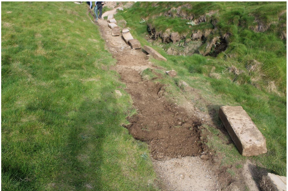
Figure 6. Photo after removal of middle group of steps.