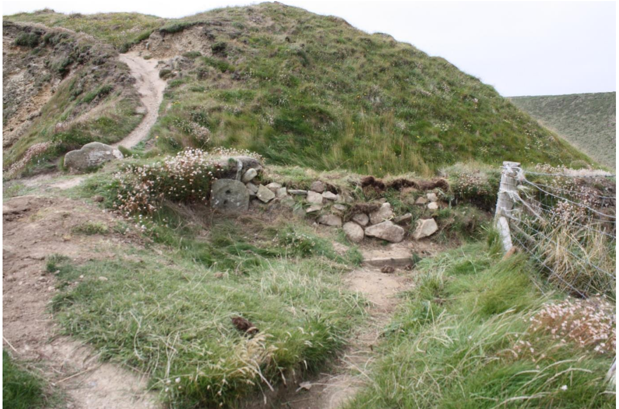
Figure 31. Photo showing former access through bank filled with stones, earth and topped with turf using available repurposed material (view from outside scheduled monument).