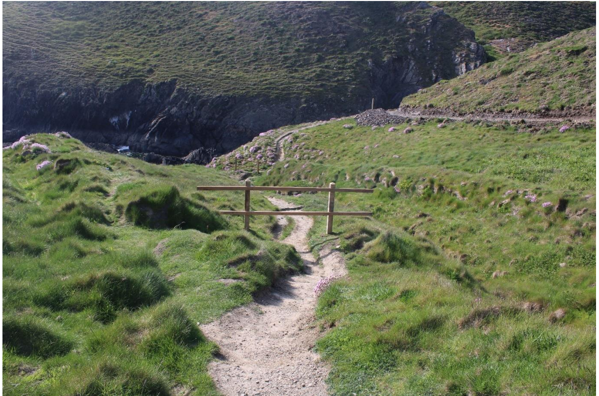
Figure 15. Photo showing the completed physical barrier after a few weeks, also showing condition of surface where top group of steps were.