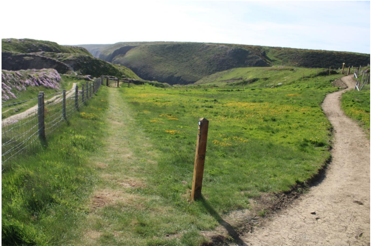
Figure 33. Photo showing post and way marker to indicate new direction to access scheduled monument.