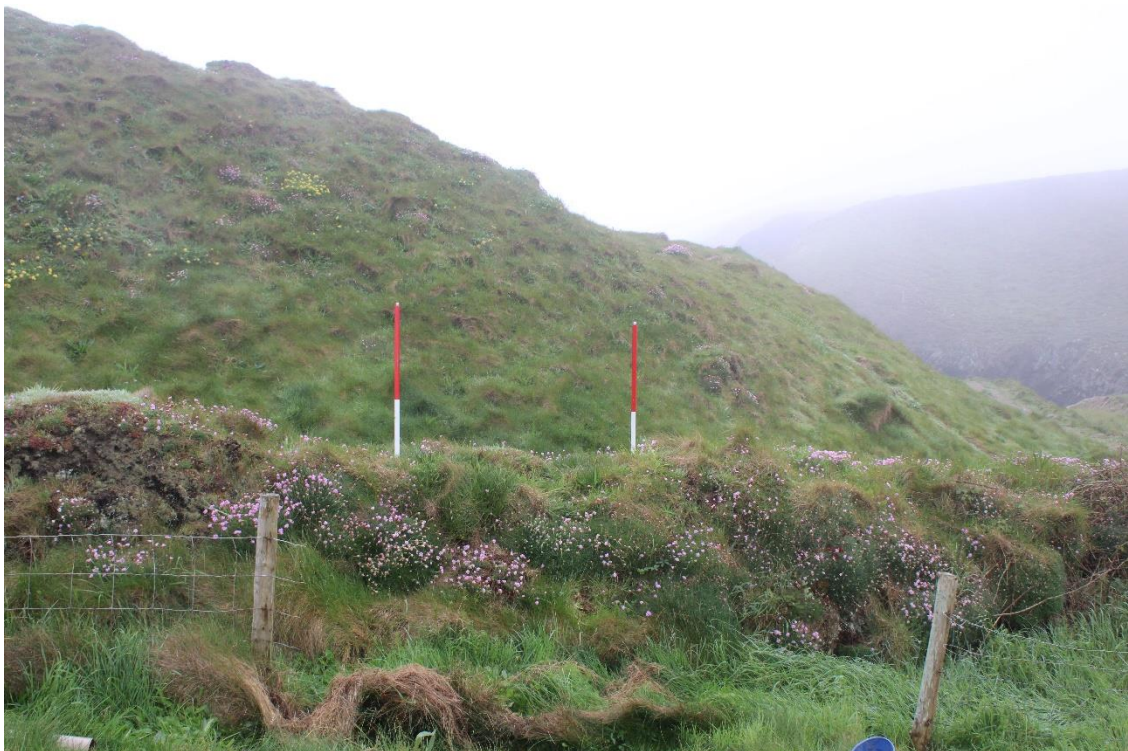
Figure 20. Photo showing cut wire fence and ranging rods marking area to be opened in bank.