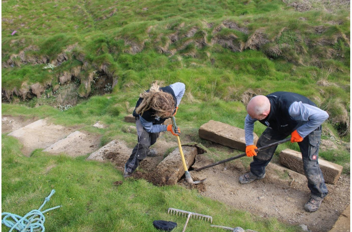
Figure 10. Photo showing removal of steps using hand tools.