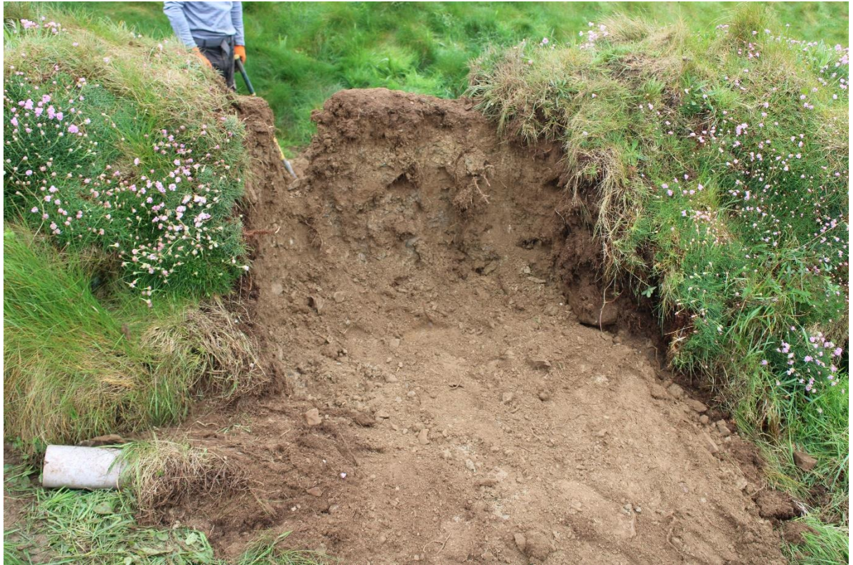
Figure 25. Photo showing the final layer separating either side of the bank being removed.