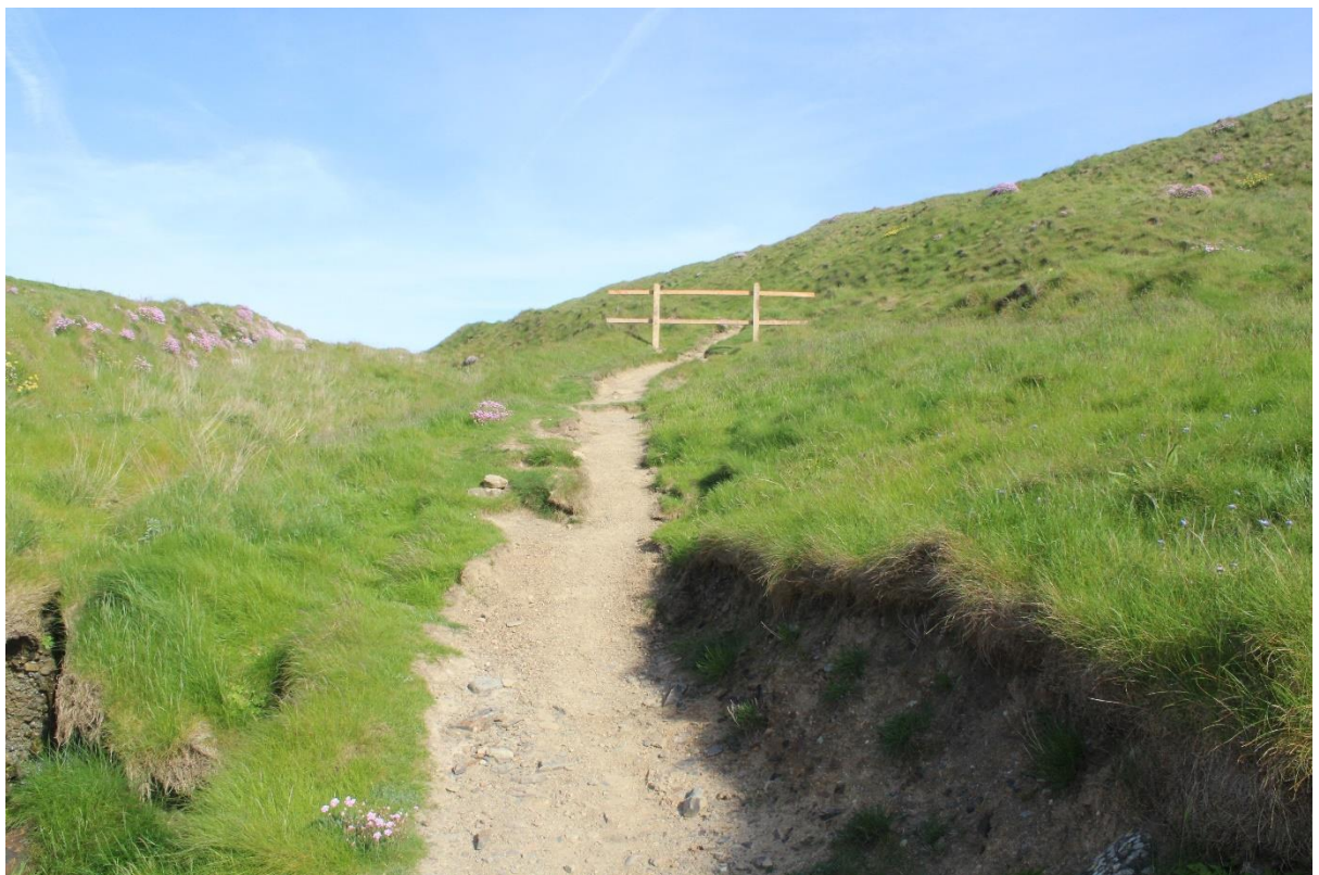
Figure 16. Photo showing condition of surface where middle group of steps used to be after a few weeks. Also, physical barrier in background.