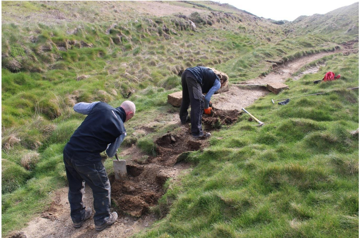
Figure 11. Photo showing use of hand tools to re-profile the surface after removing the steps.