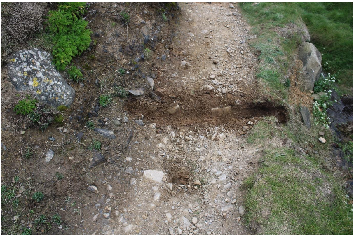
Figure 12. Photo showing shallow drainage ditch created directly above the bottom group of steps that were removed.