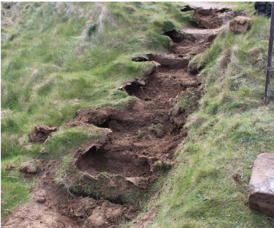
Figure 4. Photo after removal of the top group of steps.