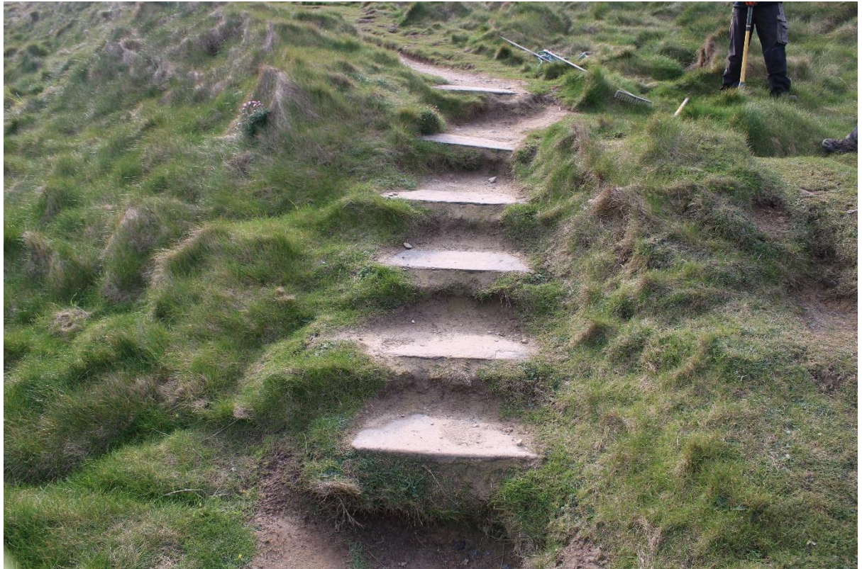
Figure 3. Photo showing top group of steps prior to removal.