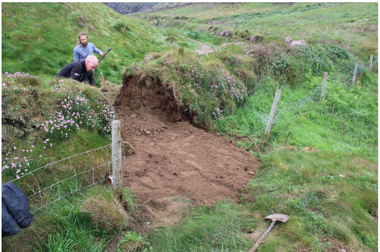
Figure 26. Photo showing the new access through bank after removing the final partition layer. Note that some of the soil from the bank has been used to level the surface through this new access.