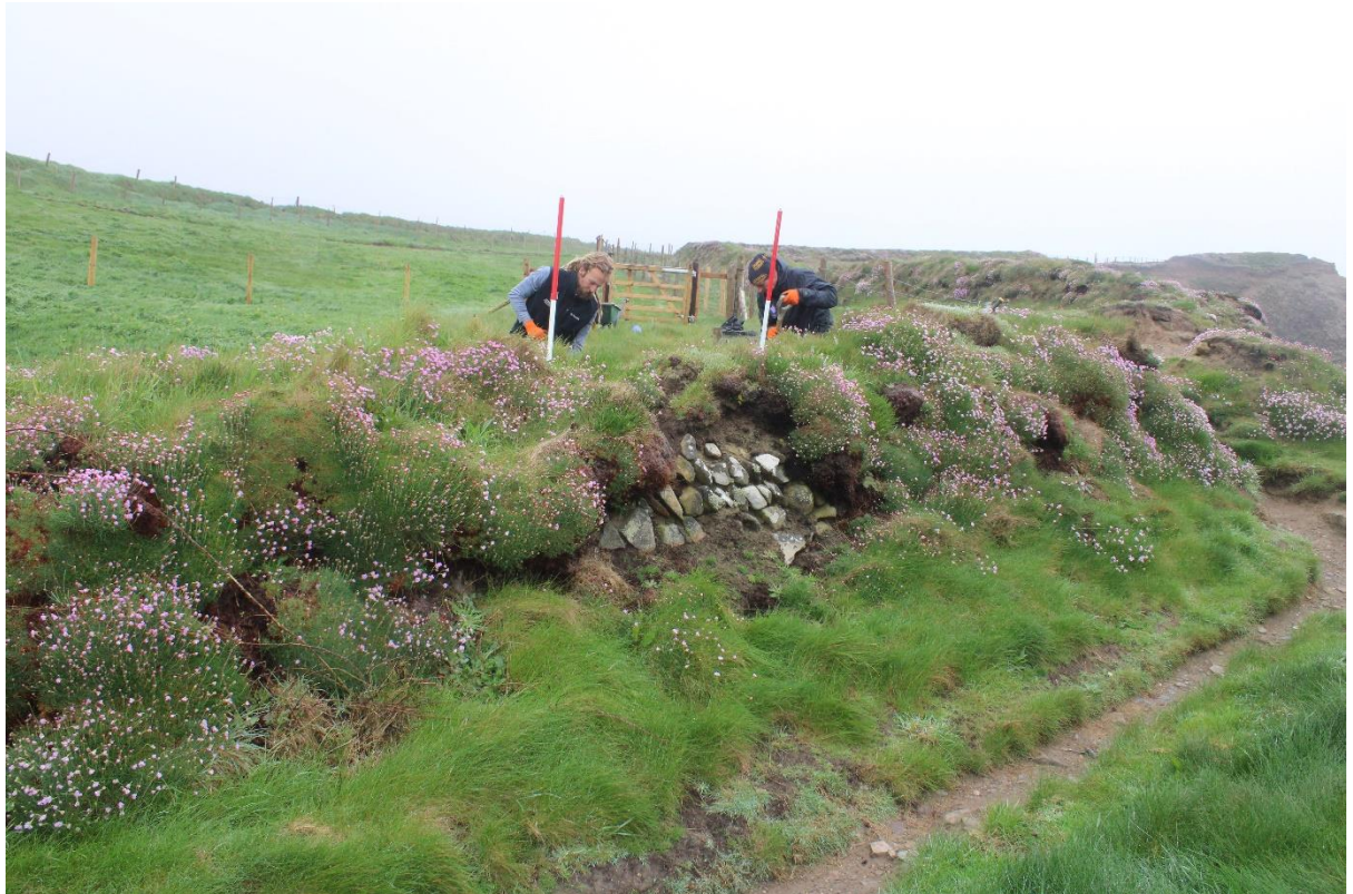
Figure 21. Photo showing wardens removing vegetation from historic bank to expose earth and stone underneath.