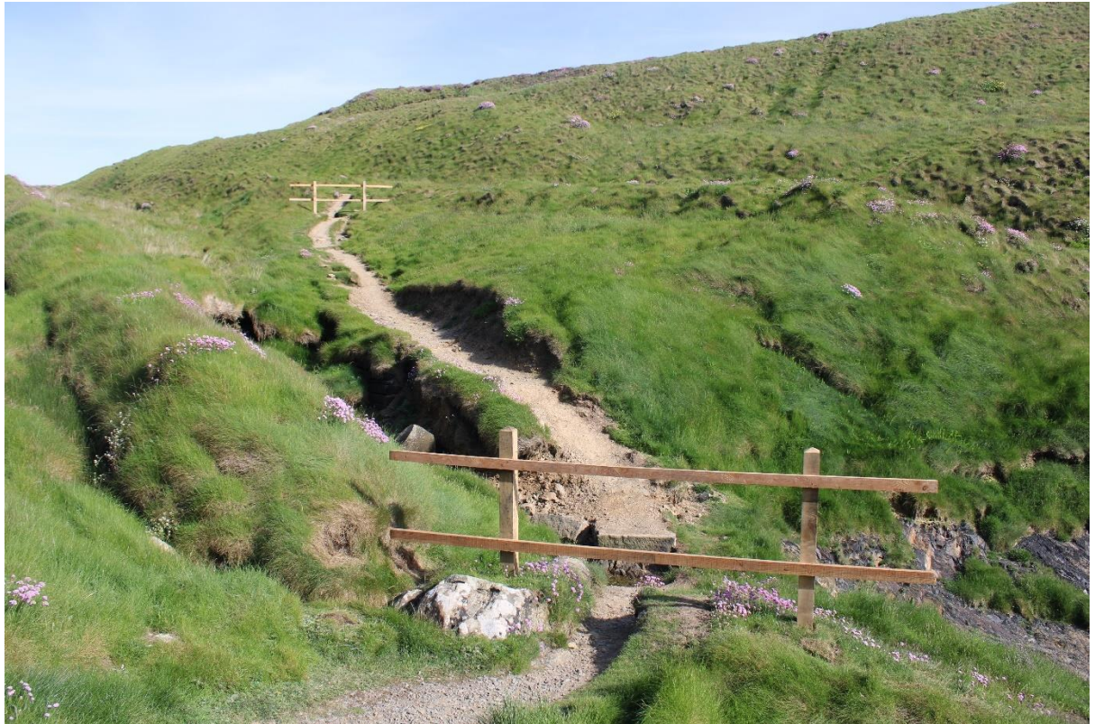
Figure 19. Photo showing northwest corner of monument a few weeks after completion. There are no traces of steps, footbridge has been removed and physical barriers are in place from both directions to deter use of the old path.