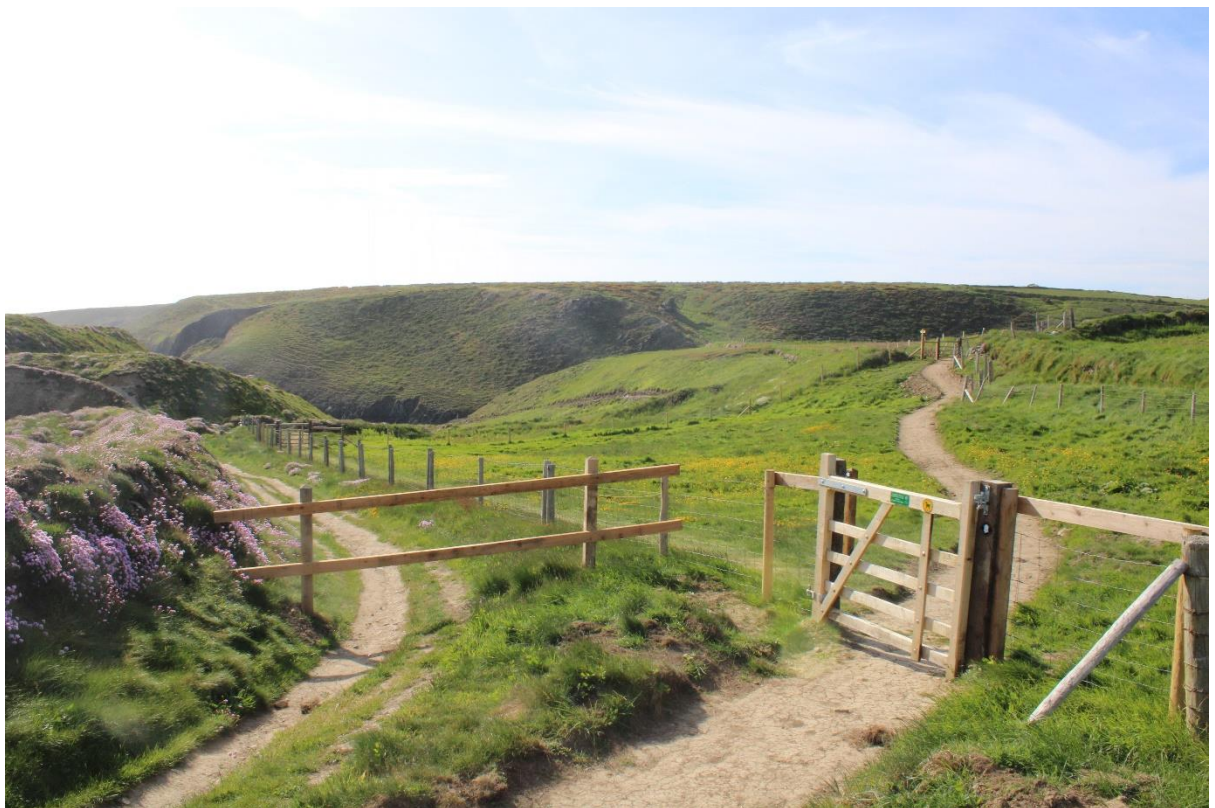
Figure 32. Photo showing physical barrier to access the old path from an east direction, also view of new path heading towards the right in the image.