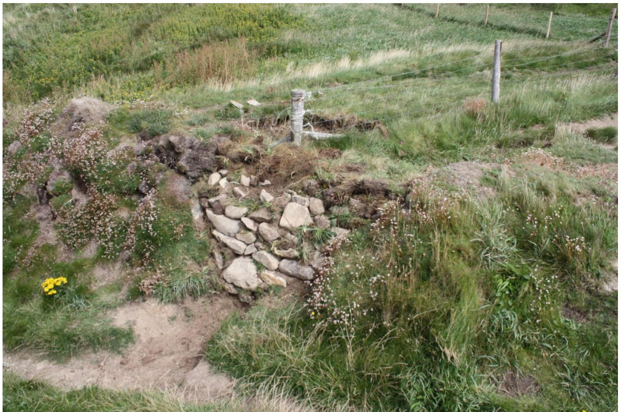
Figure 30. Photo showing former access through bank filled with stones, earth and topped with turf using available repurposed material (view from inside scheduled monument).