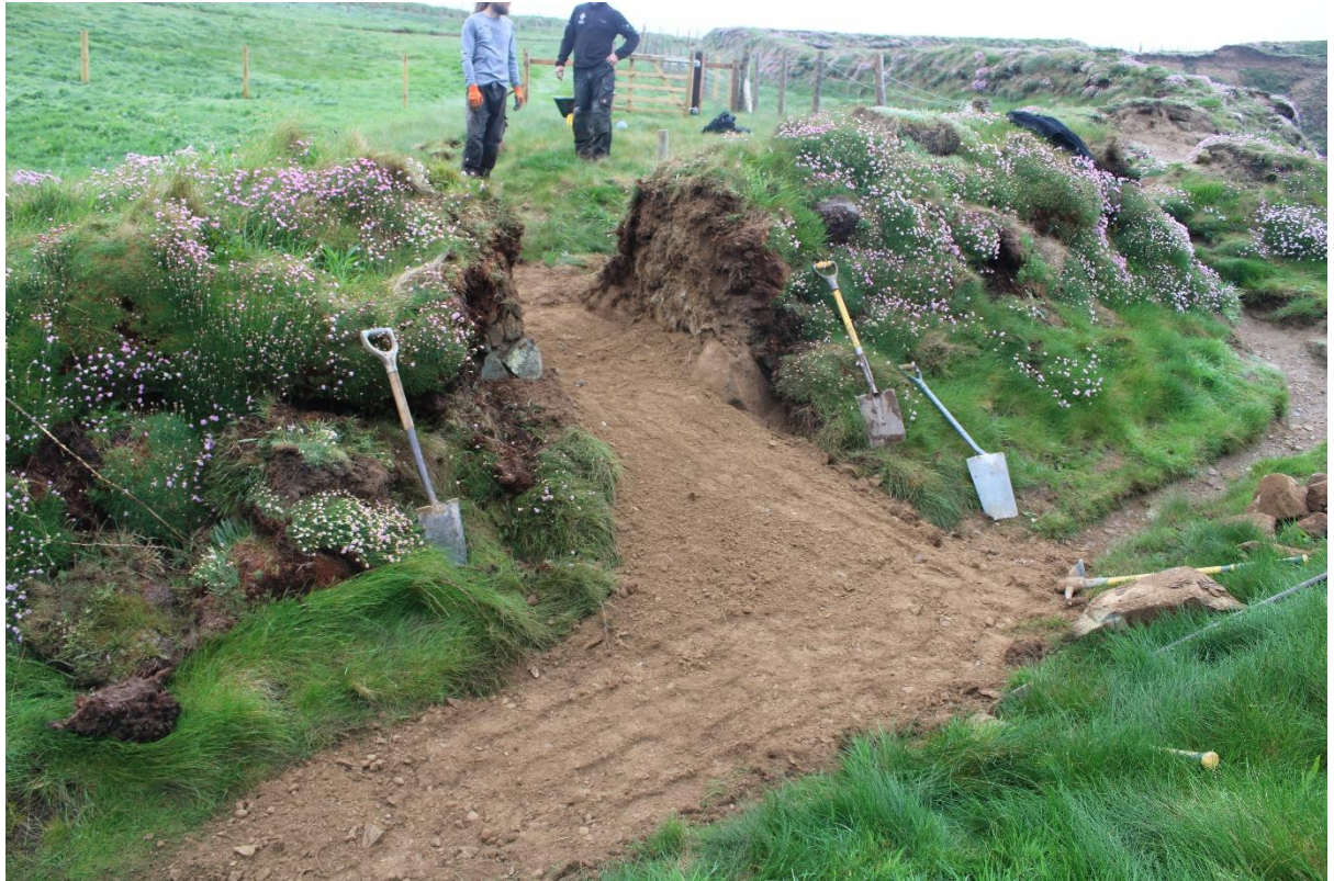
Figure 27. Photo showing new access with levelled surface from scheduled monument side.