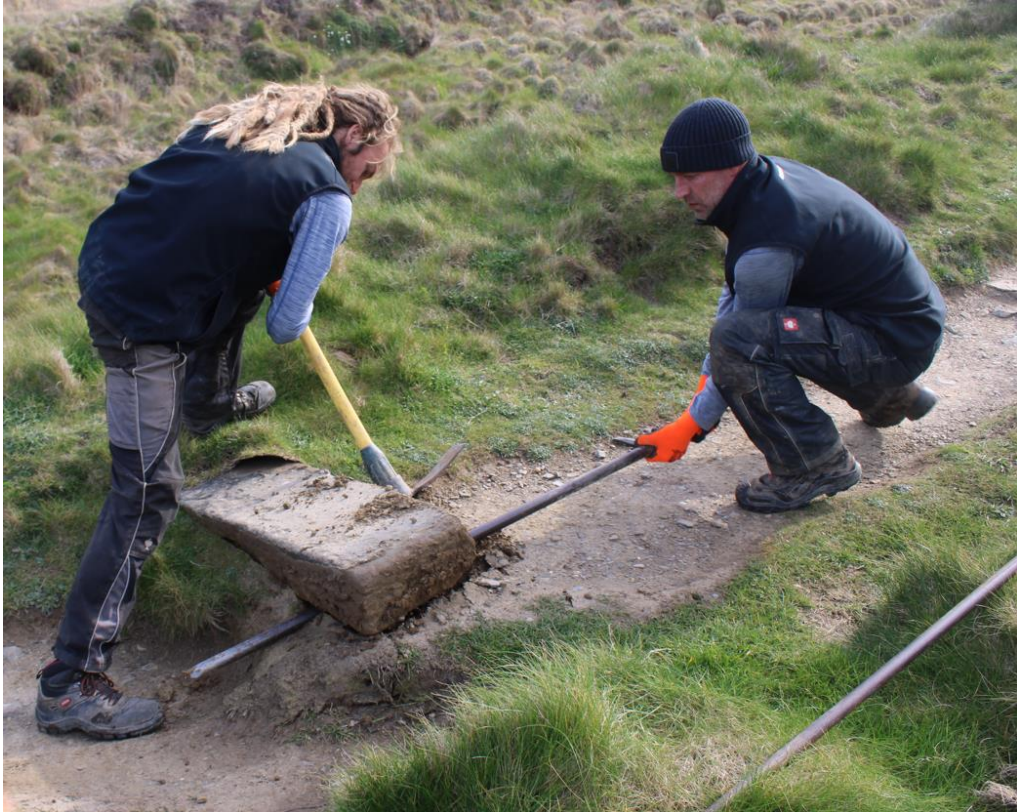
Figure 9. Photo showing approach to remove steps, including pickaxe and then crowbar to help lift steps from the ground.