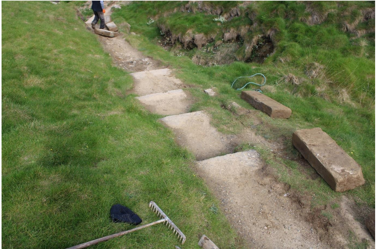
Figure 5. Photo showing middle group of steps prior to removal.