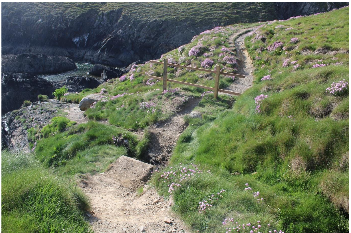
Figure 18. Photo showing the absence of the footbridge after removal and also the physical barrier to deter visitors attempting to use the old path from a northwest direction.