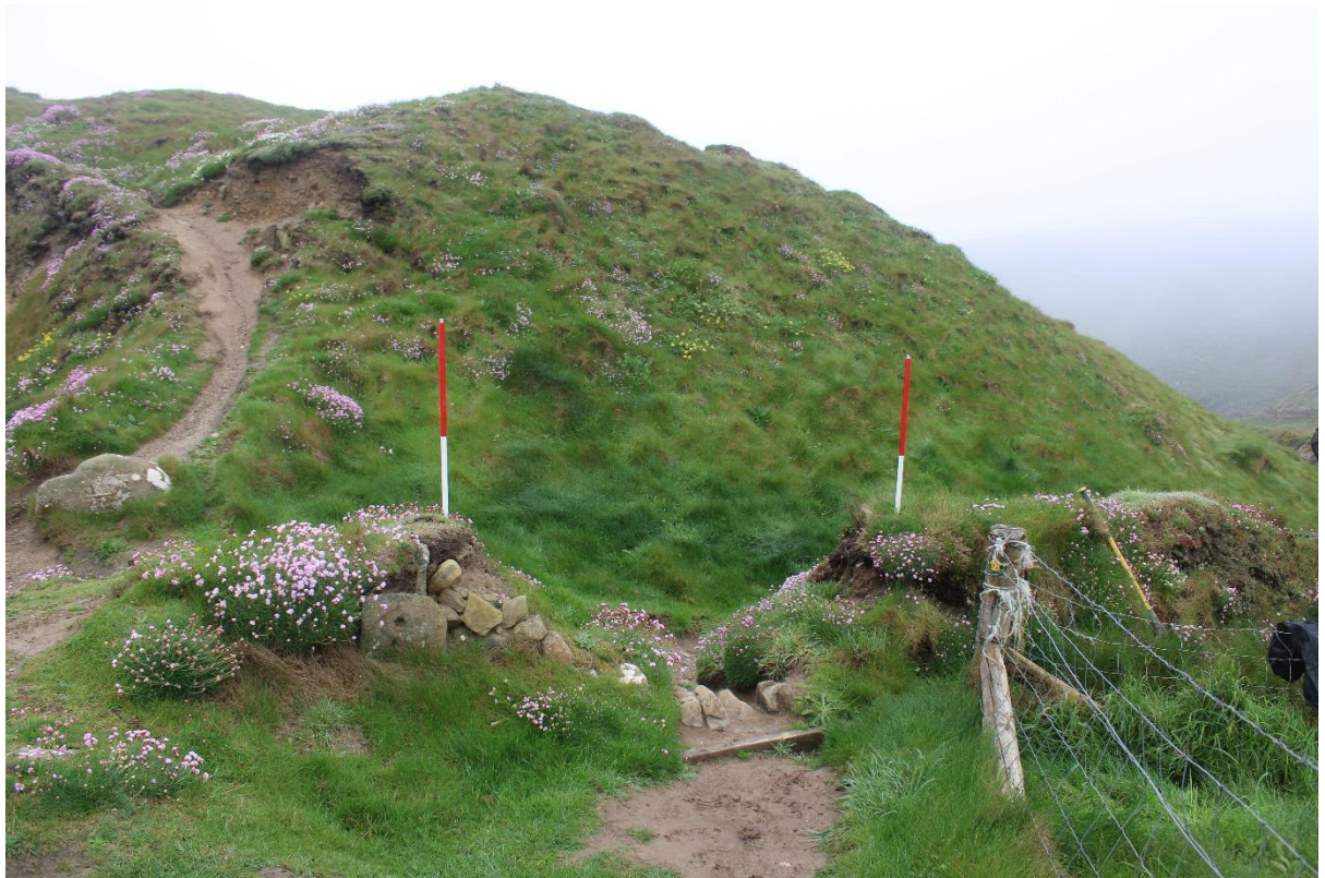
Figure 29. Photo showing access through bank to be infilled to deter use of the old coast path.