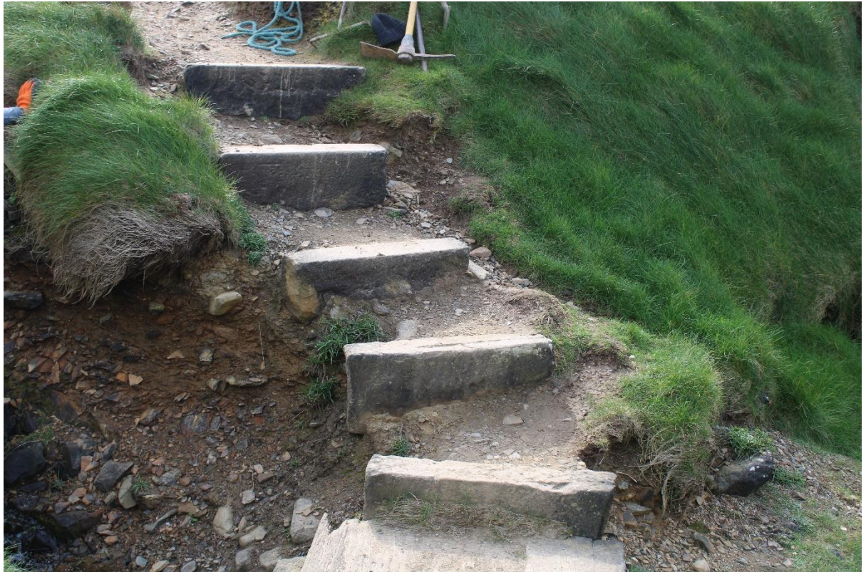
Figure 7. Photo showing bottom group of steps prior to removal.