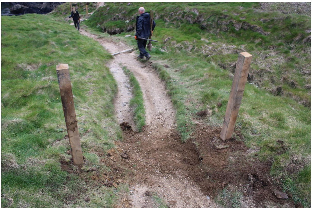
Figure 14. Photo showing posts in place packed with the material dug out to create the pits.