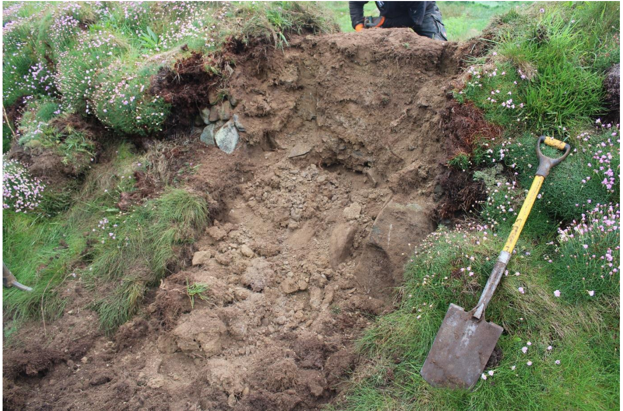
Figure 23. Photo showing the outer earth and stone from the monument side of the bank has been removed down to level required. Note large stone at base.