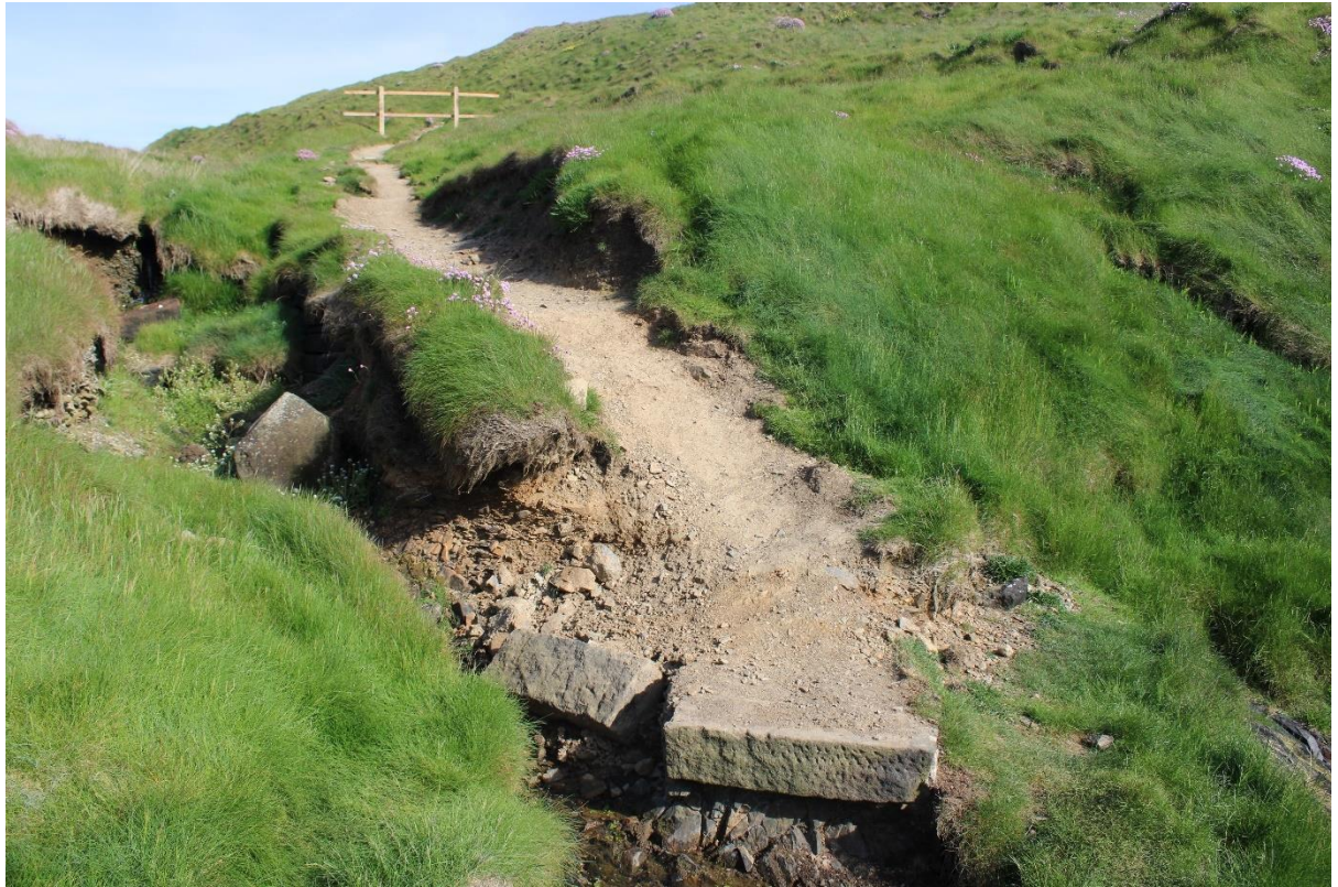
Figure 17. Photo showing condition of surface where bottom group of steps used to be, also physical barrier in background.