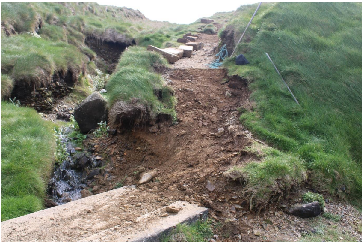
Figure 8. Photo after removal of bottom group of steps.