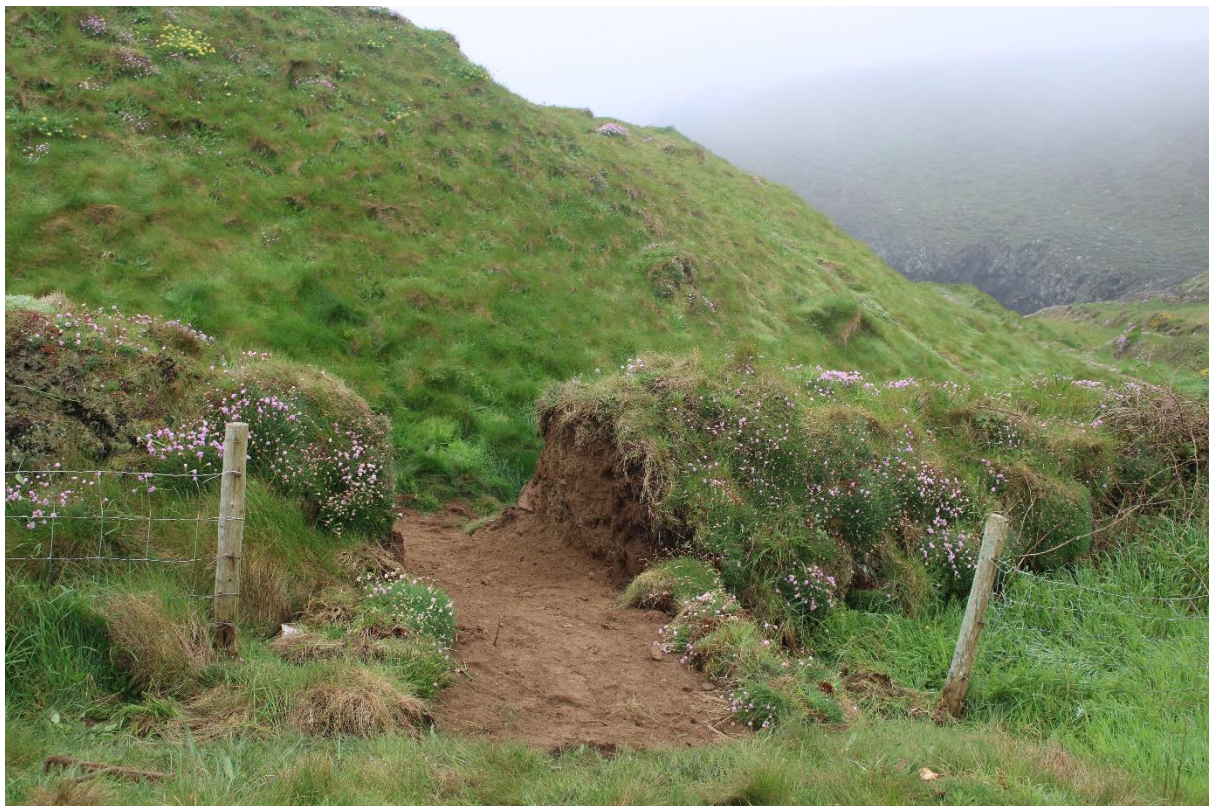
Figure 28. Photo showing new access with levelled surface from outside scheduled monument.