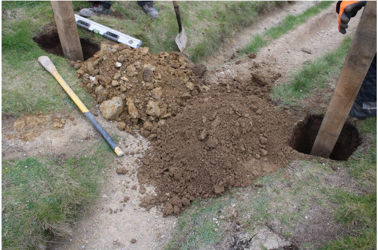
Figure 13. Photo showing pits created to house the wooden posts of physical barrier. Note the colour and composition difference between the material from the two different pits.