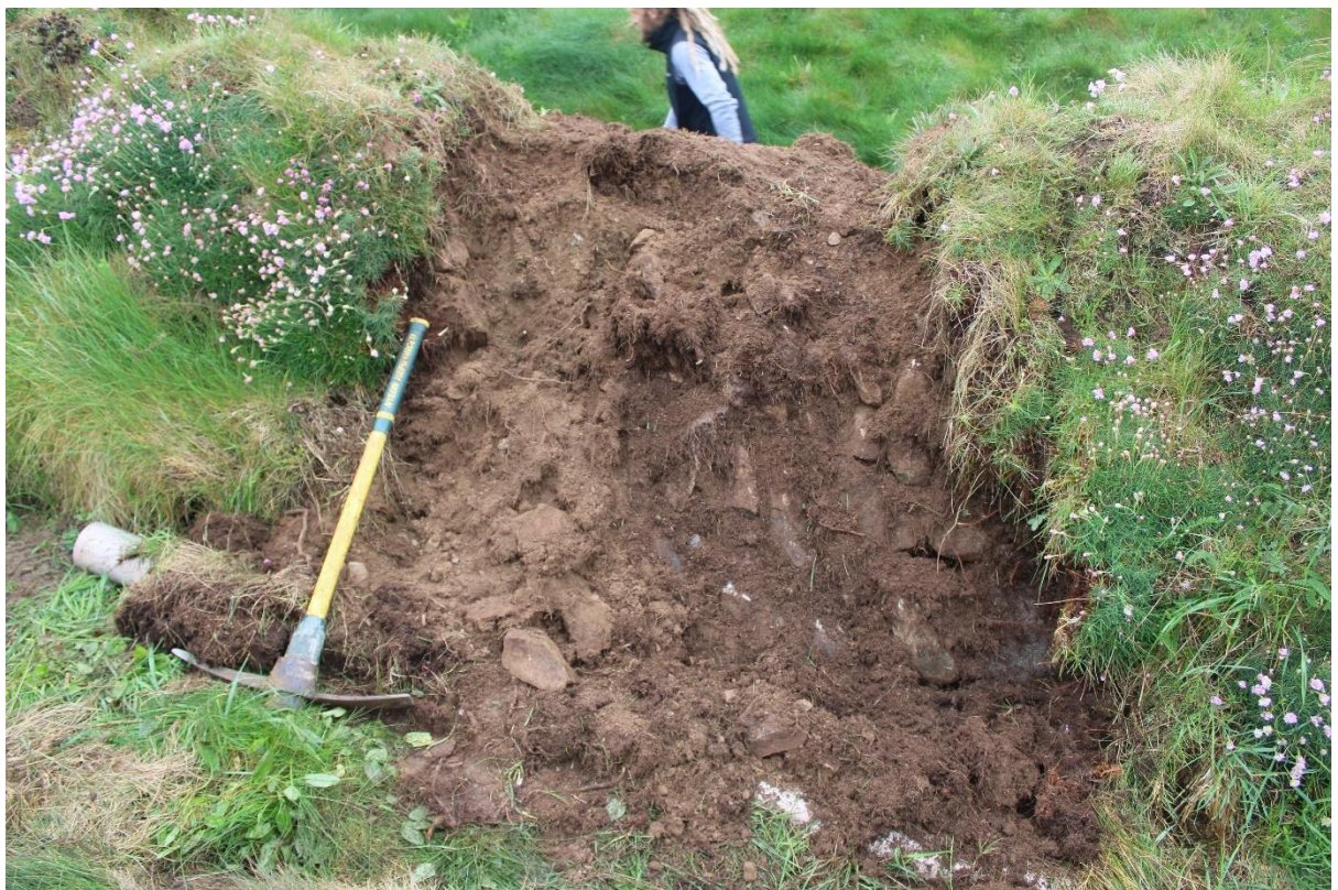
Figure 22. Photo showing start of removal of earth and stones from the opening in the bank.