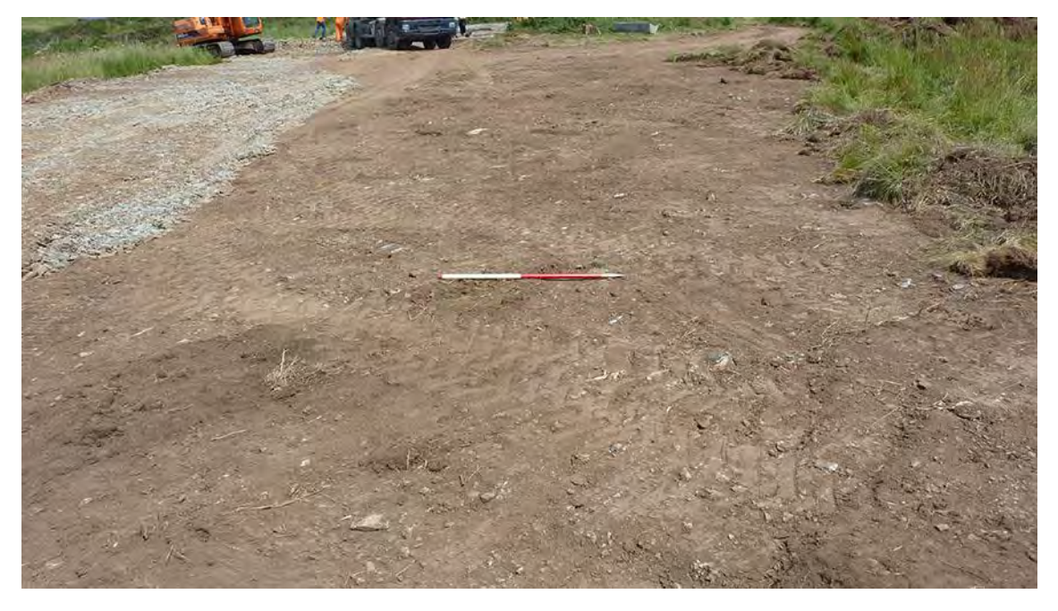
Photo 12: North facing view across the stripped area in the westernmost field. 1m scale.