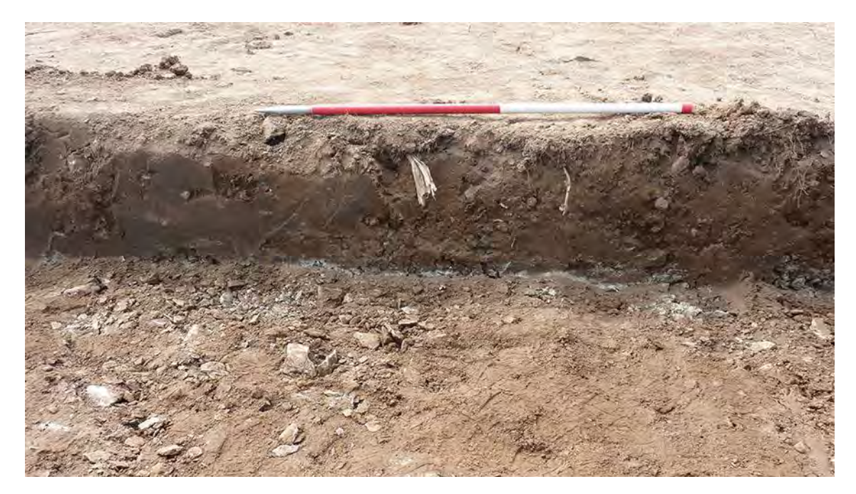
Photo 5: Typical section (east facing) through natural subsoil deposit 101 within the eastern field. Fragmented bedrock is just beginning to appear at the base of the trench. 1m scale.