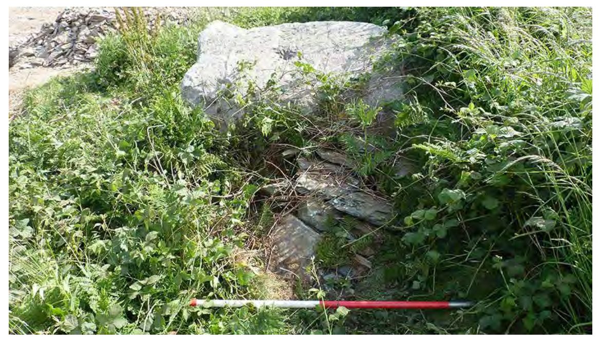
Photo 8: Looking NE at Boulder PRN 48149 with the remnants of a boundary wall in front. 1m scale.