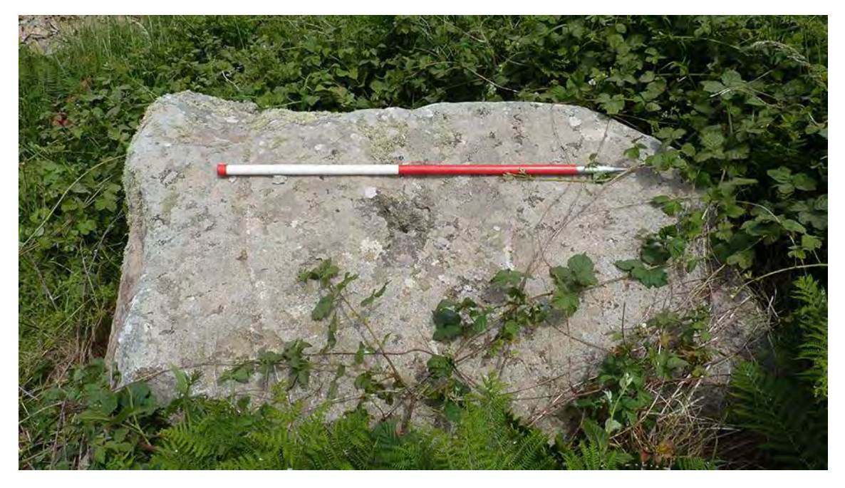
Photo 6: ENE facing shot of boulder PRN 48149, showing central drill/punch hole. 1m scale.

Photo 5: Typical section (east facing) through natural subsoil deposit 101 within the eastern field. Fragmented bedrock is just beginning to appear at the base of the trench. 1m scale.