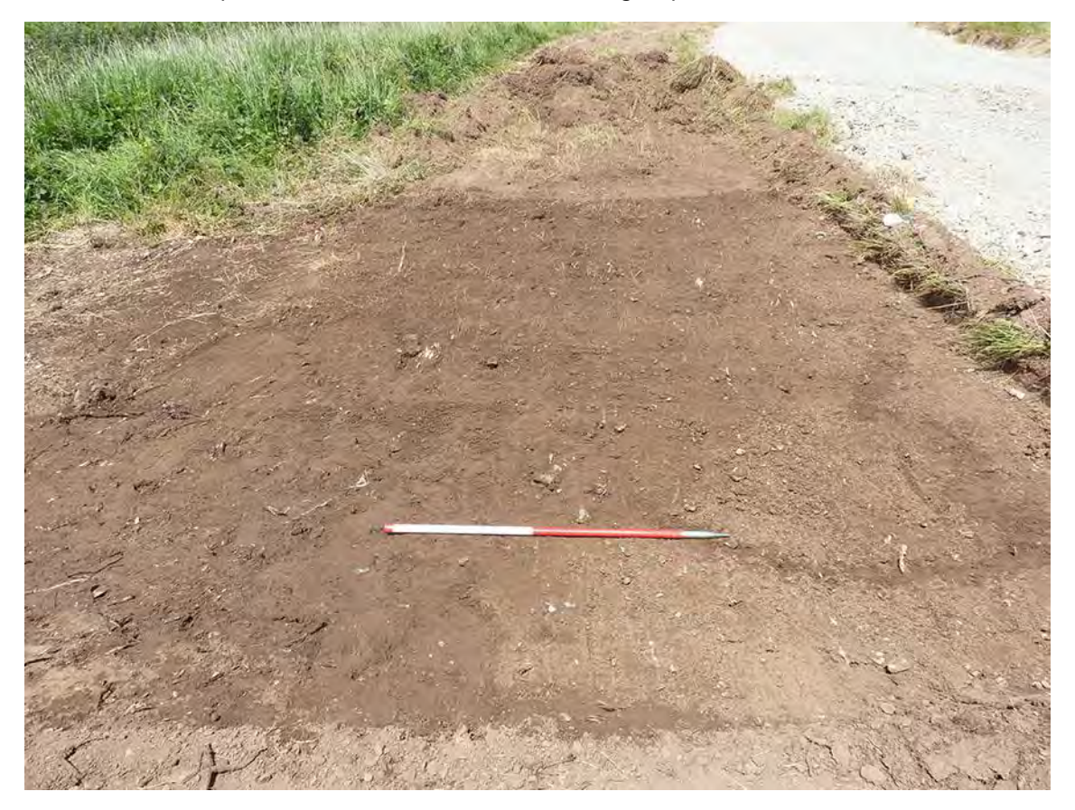
Photo 4: Looking north at area stripped alongside the main access track for the temporary site welfare units, showing topsoil deposit 100. 1m scale.