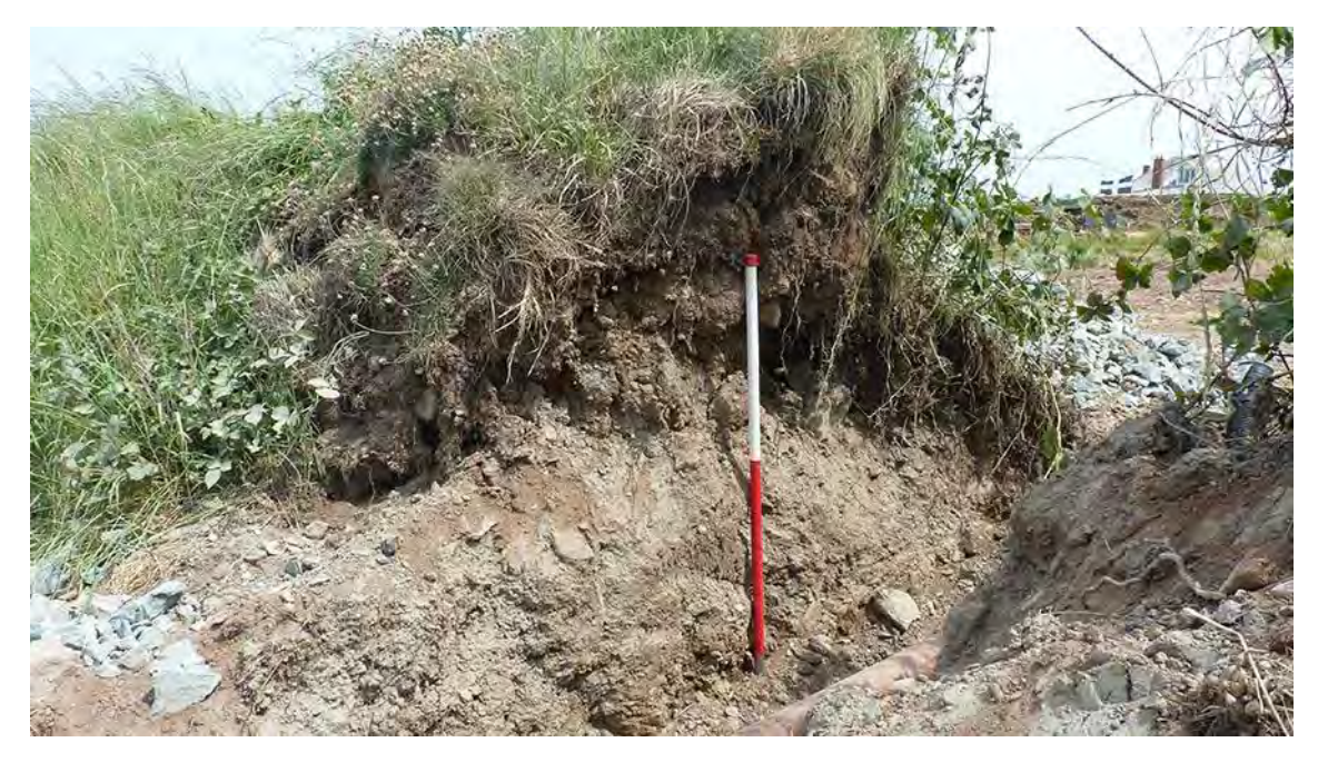
Photo 11: NE facing shot of a service trench running through the same field boundary. 1m scale.