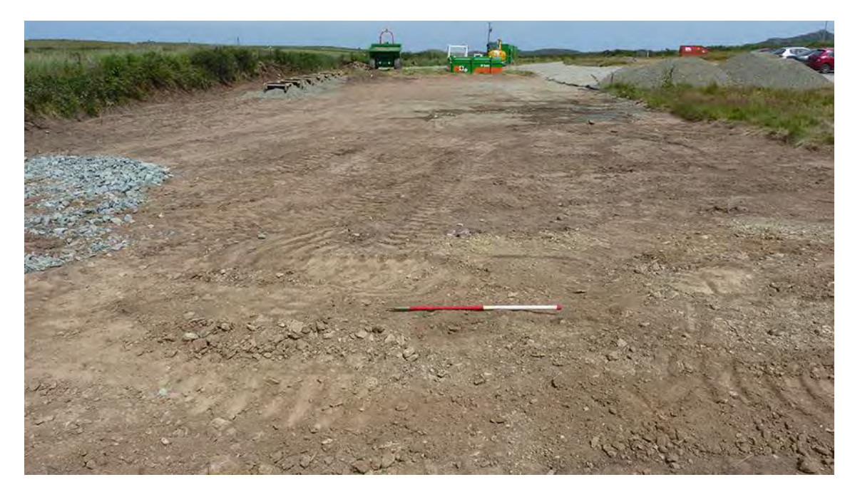
Photo 3: General view looking north across stripped area beneath the temporary office compound in the eastern field, showing deposit 101. 1m scale.