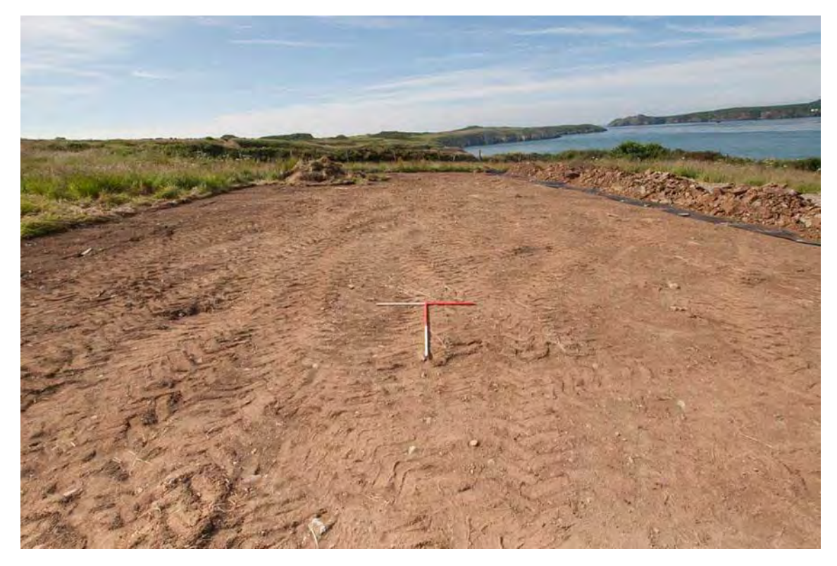
Photo 13: South facing view across the stripped area in the westernmost field, showing deposit 103. 1m scales.