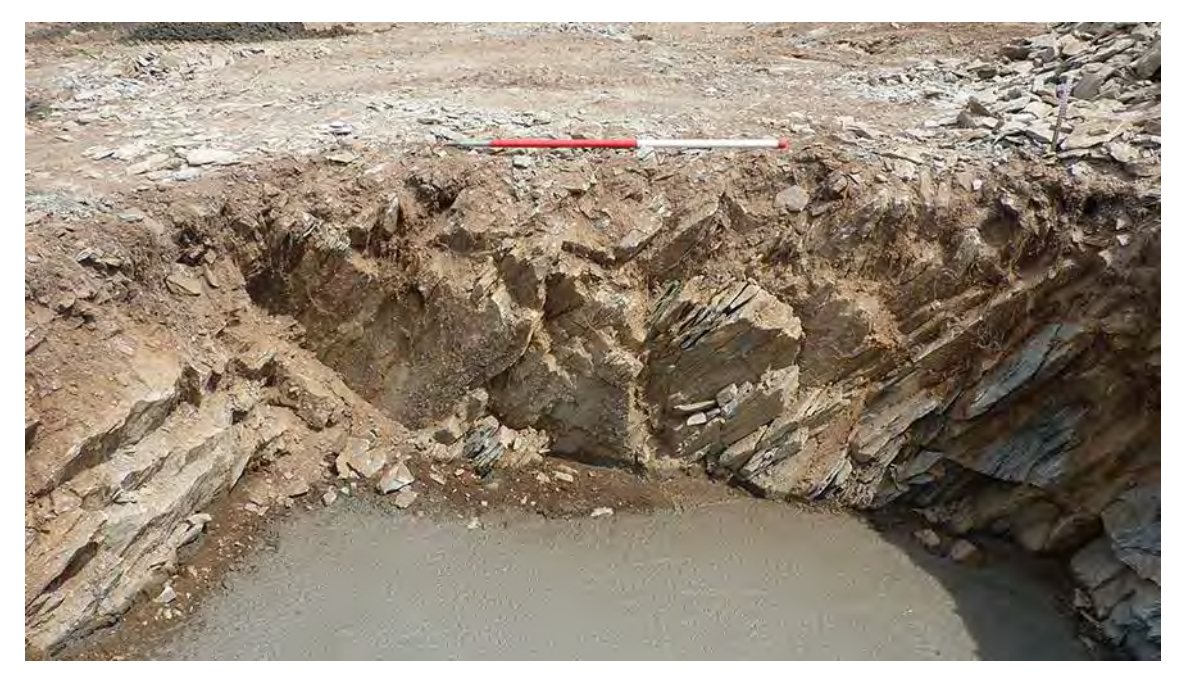
Photo 14: South facing shot of one of the foundation fads for the crane showing the thin deposit of topsoil (102) overlying the bedrock (104). 1m scale.