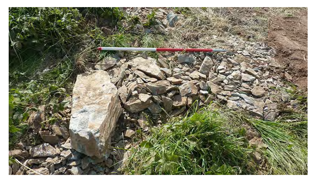
Photo 9: Looking SE across stone spread 105, representing a continuation of the boundary wall to the southwest of boulder PRN 48149. 1m scale.