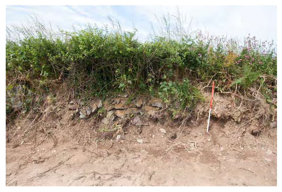
Photo 10: East facing shot of the field boundary between the two fields within the development area. 1m scale.