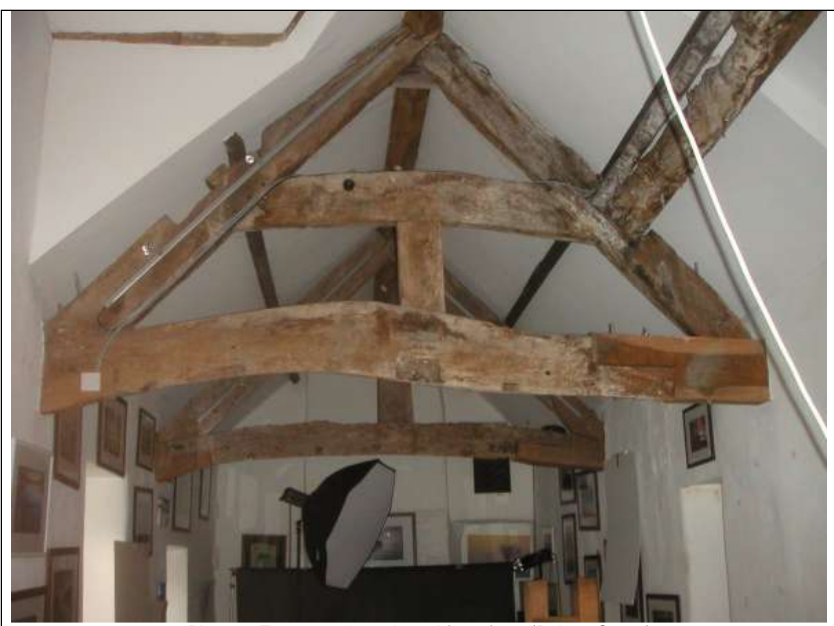
Plate 1 Trusses 1 & 2, viewed from front (Palace Street)