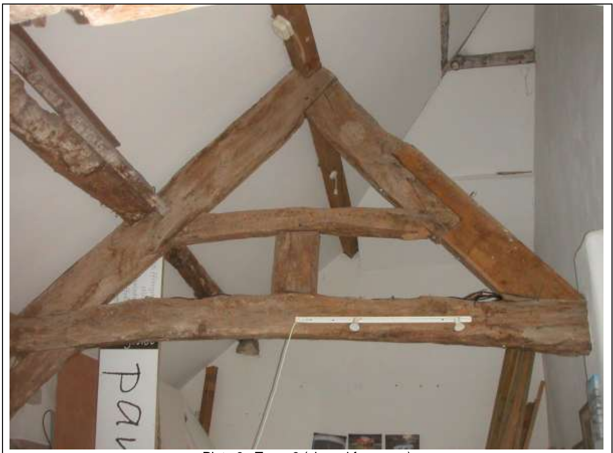
Plate 3 Truss 3 (viewed from rear)