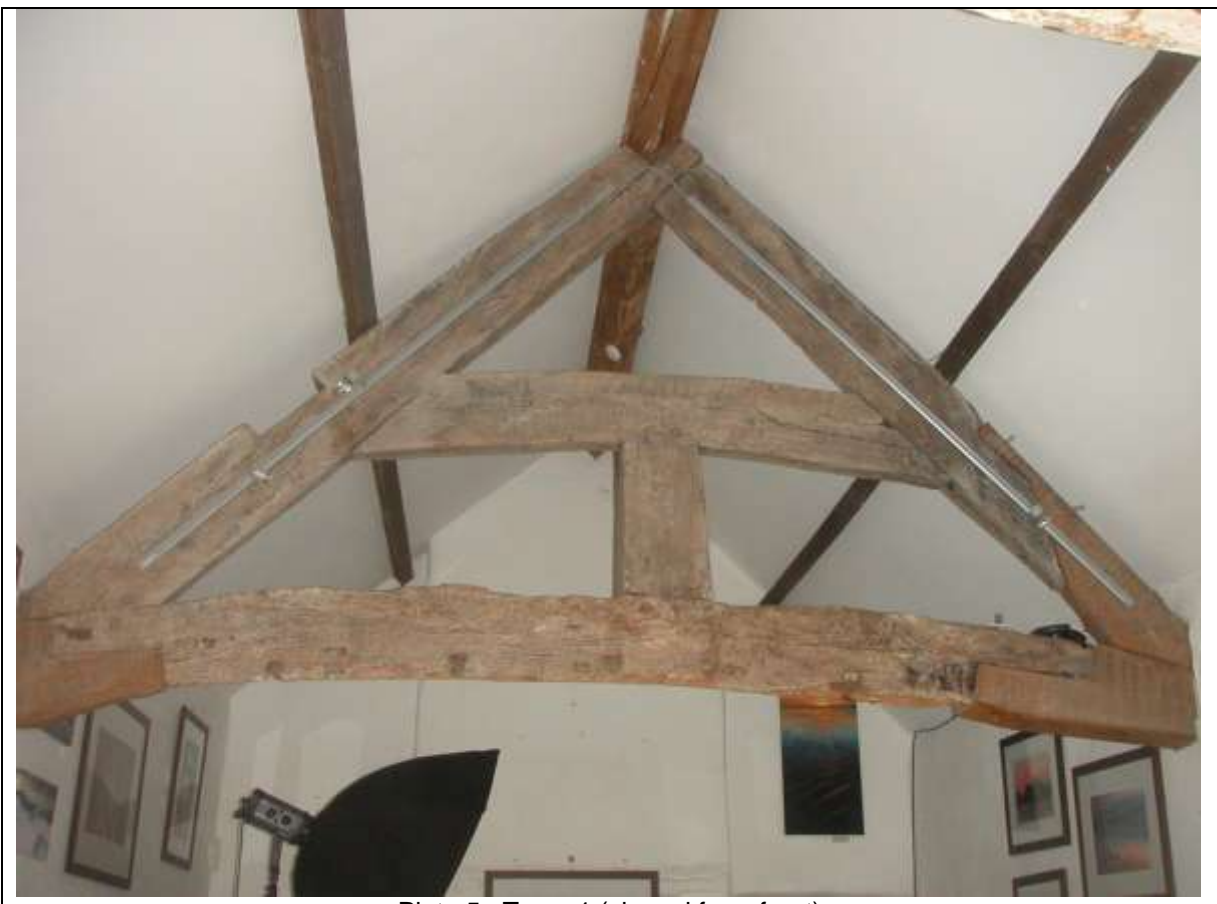
Plate 5 Truss 1 (viewed from front)