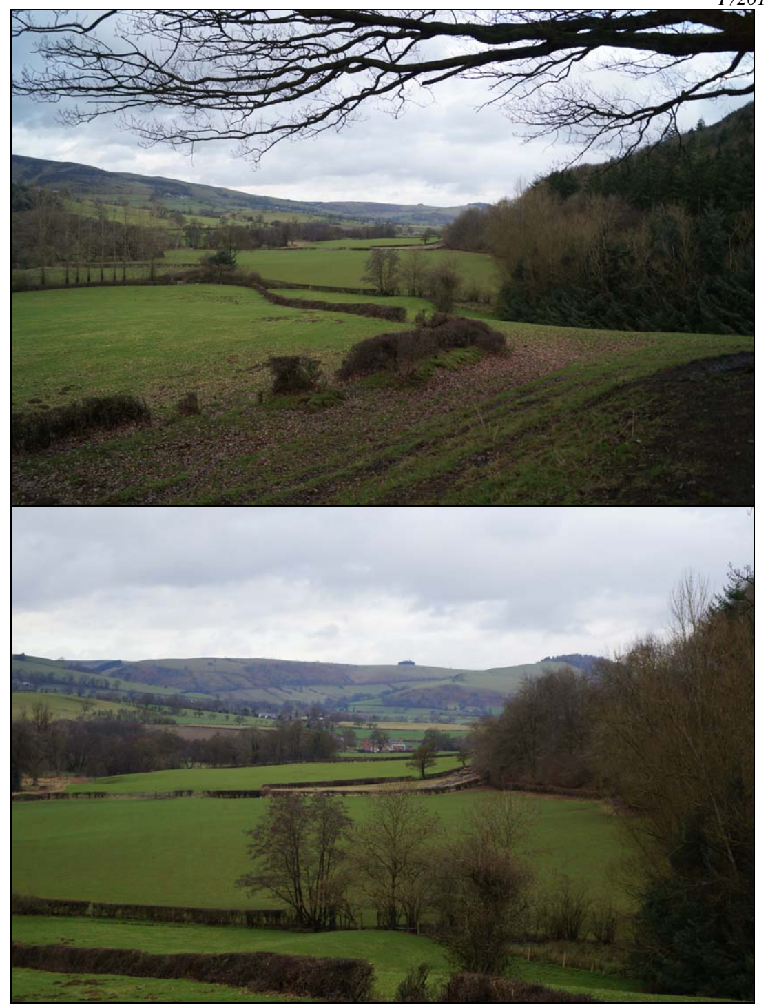
Plate 4a (Top) & 4b (Bottom): A view looking north to Tynewydd, seen at the centre of the top photograph, Plate 4a. The view is from the western side of Sycharth castle motte. The trees to the right of Tynewydd would screen the new building almost entirely from view from the castle. Only its western end would be in view, although tree planting proposed in mitigation would soon screen that view. The zoomed in view in Plate 4b shows Tynewydd more clearly.