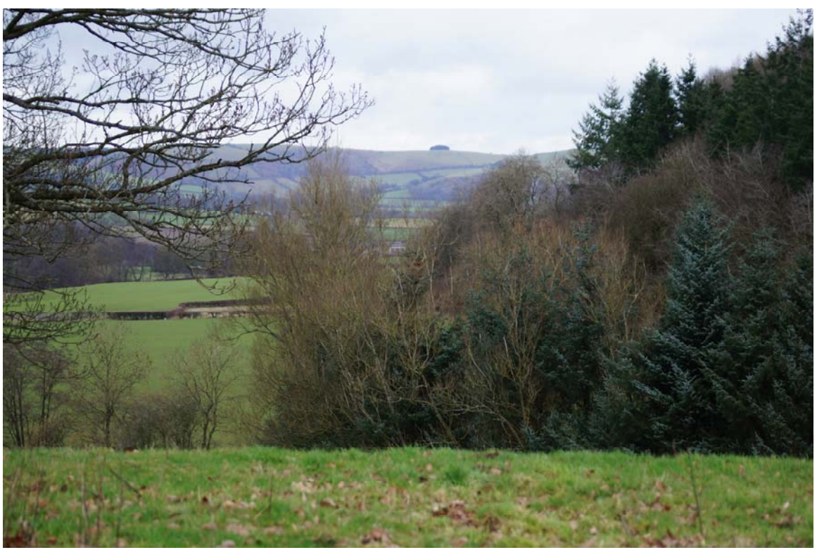
Plate 2: Tynewydd house is just visible from the centre of the motte in the view, looking northwards. The trees to the right grow on the lower slopes of Parc Sycharth escarpment and would block all views of the proposed poultry shed.

3.3.34 Not enough is known about tree cover during medieval times to understand what the best viewpoints of the castle would have been, either in the 11<sup>th</sup> and 12<sup>th</sup> centuries, or during the time of Owain Glyndwr. John Wiles (2016, 26, Figure 2) suggests that the land to the northwest of the castle site, which implies that views in that direction were not considered important. It is also likely that the steep slope of Parc Sycharth, to the east and northeast of the castle has been wooded throughout historical times and has always restricted views in those directions.