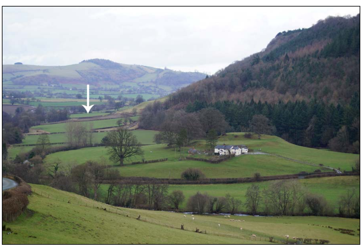
Plate 5: Tynewydd is visible left of centre in this view looking north-northeast along the Cynllaith valley. The scheduled earthwork castle of Sycharth is centre right. The post-medieval dwelling of Brynderw stands in front of the monument, which is also partially screened by mature trees.

This photograph is taken from the eastern side of Coed y Golfa, on the road leading south from Llansilin towards the Tanat valley. It provides one of the best viewpoints to appreciate the castle and the natural knoll on which it stands. It is possible to see how the Cynllaith valley narrows at this point, which may make the castle's location significant, as it would make it difficult from anyone to move along the valley floor here without being seen.