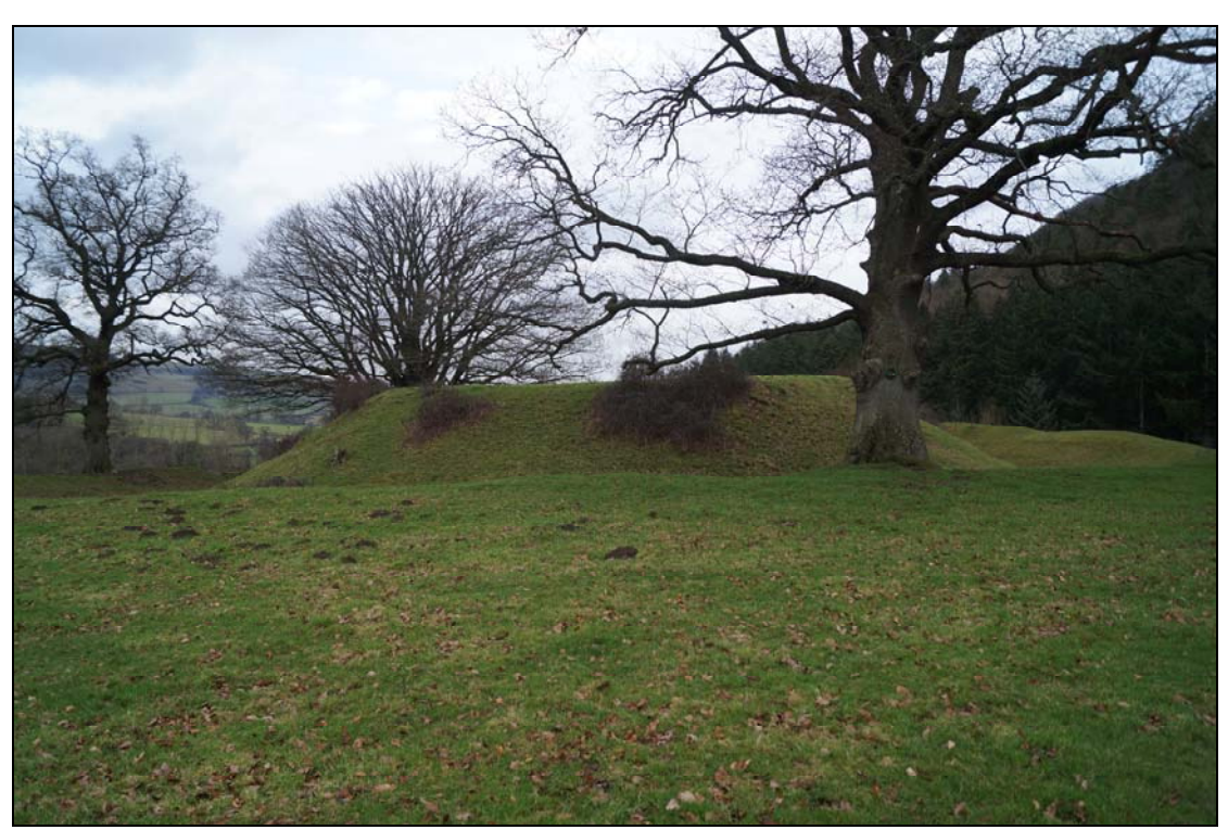
Plate 1: A view of Sycharth castle motte looking northwards from within the bailey. The monument is best appreciated from its southern side and the natural knoll and the earthworks of the castle itself would block views northwards towards the proposed development. The wooded escarpment of Parc Sycharth, in the background to the left in this image, would also block views of the development from most of the scheduled area.