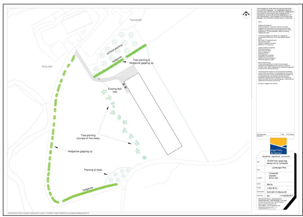
Figure 2: A plan of the proposed development, illustrating the position of new tree planting which will screen views of the building from the south and southwest.